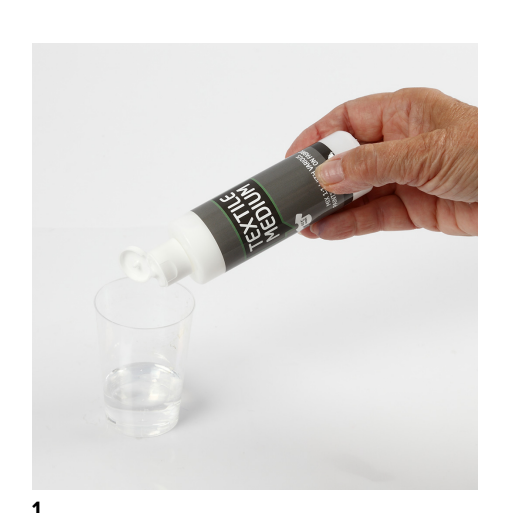
Mix Textile Medium with water in a ratio of 1:1.