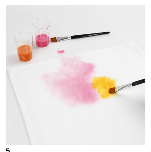
Apply the colour with a brush. Let the colours slightly run into each other, but leave some areas white. Turn over and paint the back of the cushion cover.