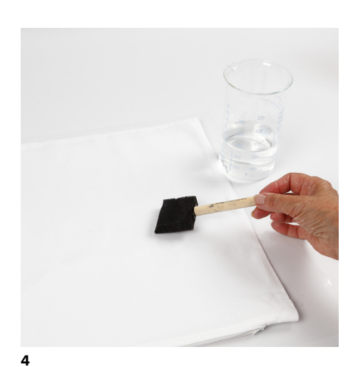
Moisten the fabric with water, applied with a foam stencil brush.