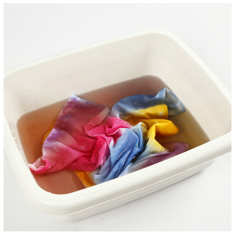
{\bf 7} Rinse out the excess colour. The cushion cover may be washed at 30 ^{\circ}{\rm C}.