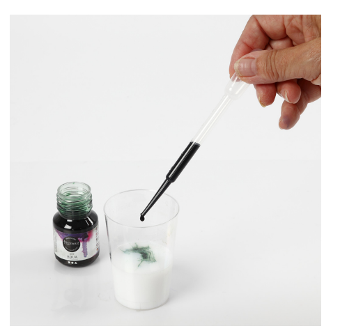
2 Fill 3/4 of a pipette with art aqua liquid watercolour and add this to the mixture (Textile Medium and water).