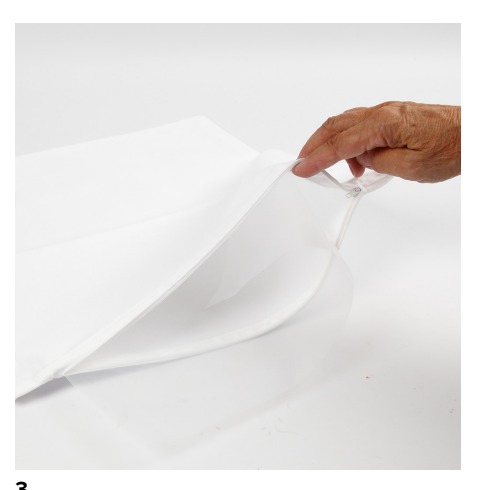
Wash (at 40°C) and dry the cushion cover before you start. Place it on a piece of plastic. Place a piece of plastic inside the cushion cover as well.