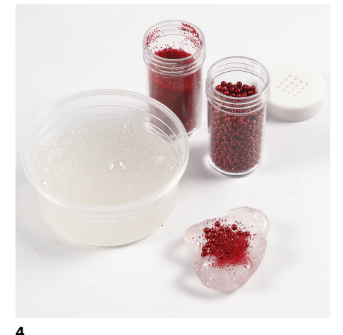
Mix a blob of Sticky Base with two different sizes of mini glass beads. Knead the mixture together well.

Paint the top above the masking tape with craft paint. NB: paint from the masking tape and upwards in order to avoid the paint seeping underneath the masking tape.