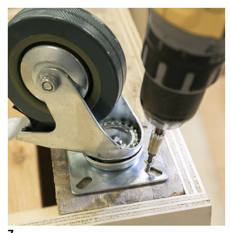
Screw on the casters.