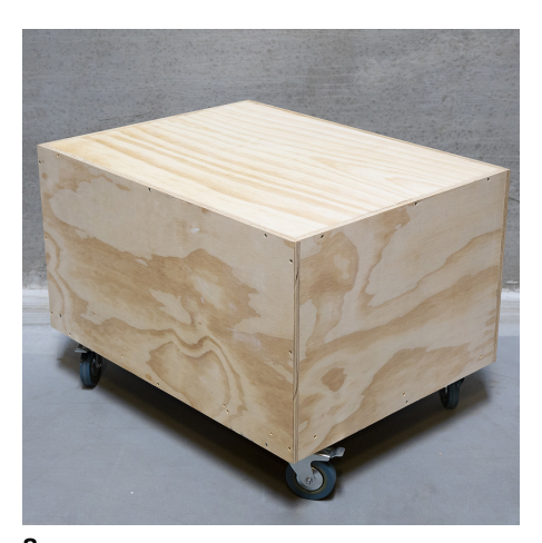
8 The podium is now finished.