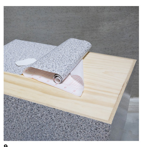
The self-adhesive film fits across the width of the 45 cm wide podium. Start with the sides and make sure to start away from the edge on one side, so that the foil can overlap. Finish with the top board; attach the foil 2 cm over the sides so that you can cut a notch for the corners to be stuck down over the sides.