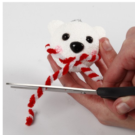
9 Trim the scarf to a suitable length with a pair of scissors.