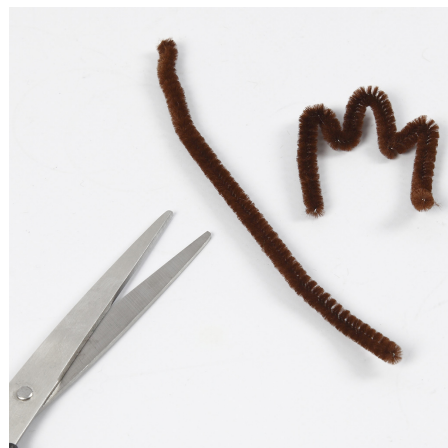
18 Cut a pipe cleaner in half, bend it to make antlers as illustrated in the photo.