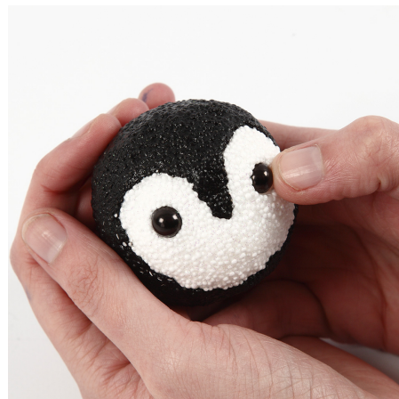
12 Push the eyes into place.