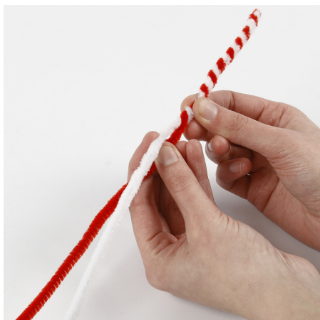
7 Make a scarf by twisting two pipe cleaners around each other.