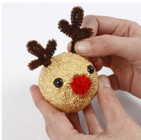
20 Push the antlers into the bauble.