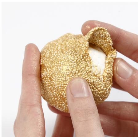
16 Make the reindeer in the same way by first covering the polystyrene ball.