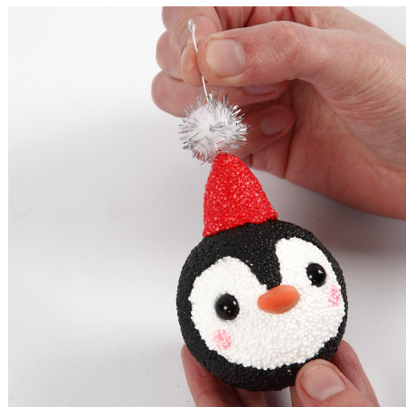
15 Push an eye pin through a pom-pom and through the pixie hat.