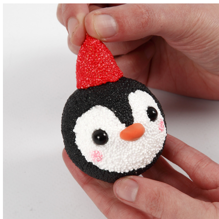
14 You may decorate the figures with a pixie hat made by modelling red Foam Clay into a small cone shape. Lightly push the pixie hat onto the top of the bauble.