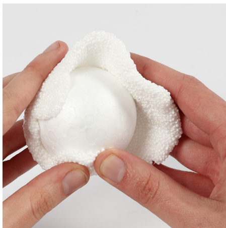
1 Cover the polystyrene ball with Foam Clay.