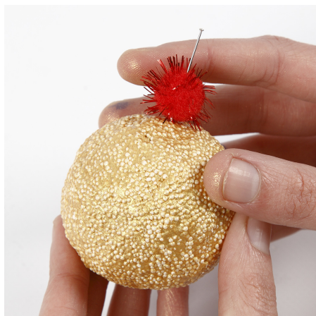
17 Attach a pom-pom for the nose with a pin.