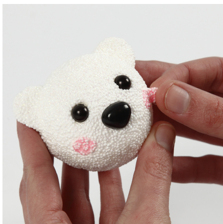
4 Make cheeks with two small blobs of pink Foam Clay.