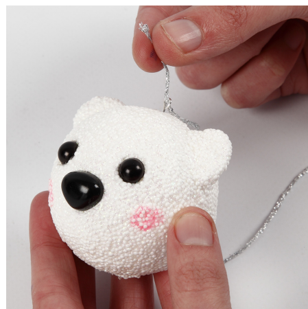
6 Tie a string for hanging through the loop.