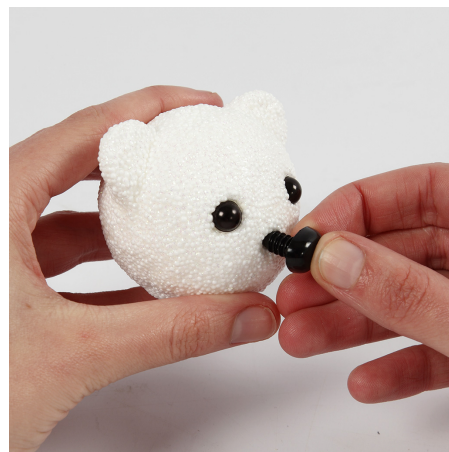
3 Push the eyes and the nose into place.