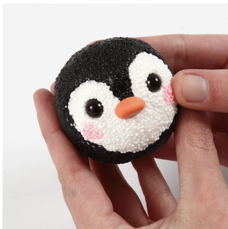
13 Model a beak from orange Silk Clay and push it gently onto the bauble. Make cheeks from pink Foam Clay like on the polar bear.