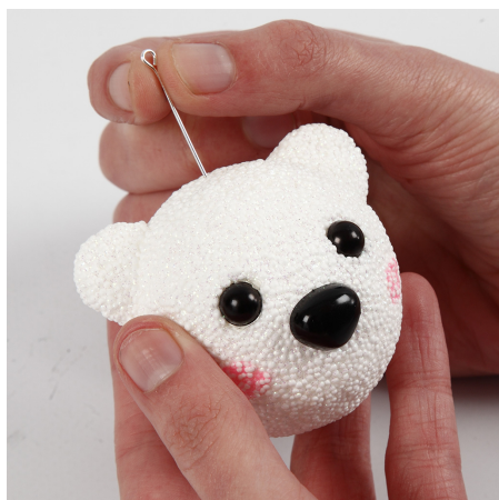
5 Push an eye pin into the top of the bauble.