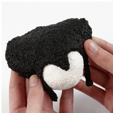
11 Attach black Foam Clay to the rest of the polystyrene ball and slightly onto the white Foam Clay, making markings like a penguin.