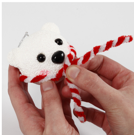
8 Tie the scarf tightly around the bauble and twist it around itself to keep it in place. Trim the scarf to a suitable length with a pair of scissors.