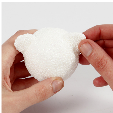
2 Model two ears from Foam Clay and attach.