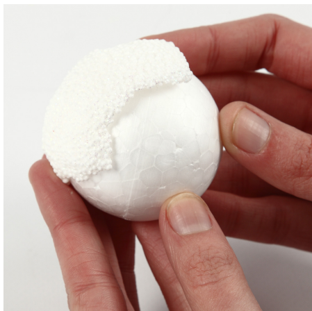
10 Make the penguin by covering half of the polystyrene ball with white Foam Clay.