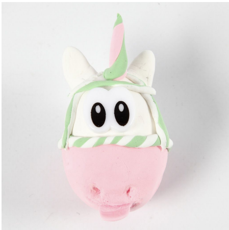
Step 6. Attach the halter and the horn onto the head.