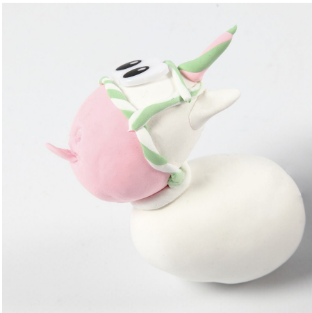
Step 7. Assemble the head and the body with a small blob of Silk Clay.