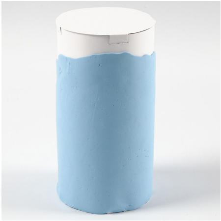
Step 2. Cover all over with coloured Silk Clay except the top. Cover the top with white Foam Clay.