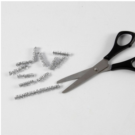
Step 10. The tail and the mane: Cut approx. eight 3 cm pieces of pipe cleaner.