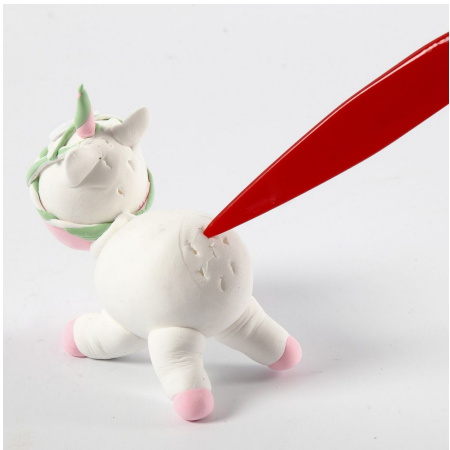
Step 11. Make holes for the tail and the mane and push the pieces of pipe cleaner into the holes.