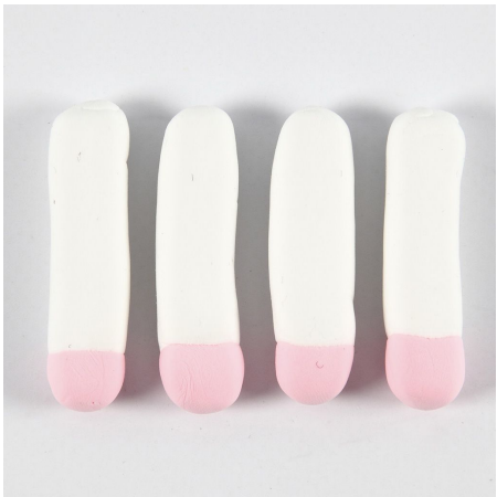
Step 8. Legs with hooves: Roll four "sausages" from white Silk Clay and attach a coloured ball of Silk Clay at each end.