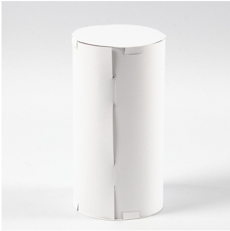
Step 1. Assemble the card model.