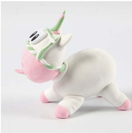
Step 9. Attach the legs to the body.