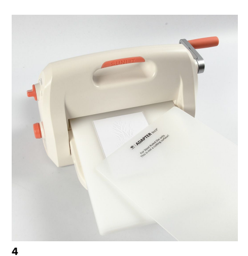
Place a piece of A6 card in the embossing folder and run it through the machine, with the adapter placed on top.

Trim card and glitter paper to the same size as the backing of the frame. Glue the parts together; the wooden backing panel, glitter paper and finally the patterned card with the cut-out text. Glue on the small parts that fell off when die-cutting.