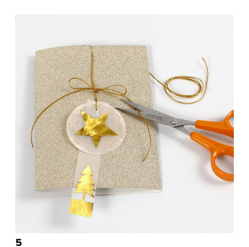
Make a small hanging decoration by attaching both decorated vellum paper designs onto one piece of gold thread (finish with a knot). Make a small vertical slot down the middle of the greeting card and attach the hanging decoration so that it is secured in the slot. (The recipient will then be able to remove it and use it elsewhere). Cut an extra piece of gold thread and tie a bow as shown.