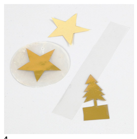
Remove the other protective layer from the sticky double-sided foil and attach the designs onto the cut-out vellum paper shapes.