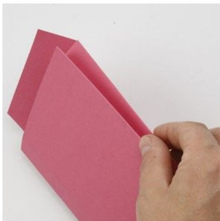
8 Press the front and back of the bag together and a fold is made on the sides of the bag.