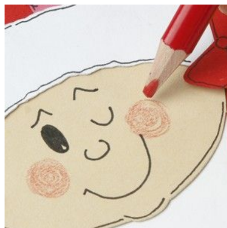
15 Make red cheeks with a coloured pencil.