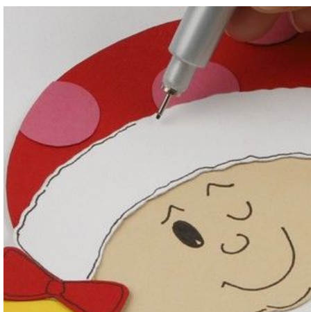
14 Draw a face and mark the borders with a thin black marker.