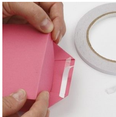
9 Fold the bottom like the end of a present and assemble it with double-sided tape.