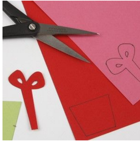
17 Draw the presents on cardboard using the patterns and cut them out.