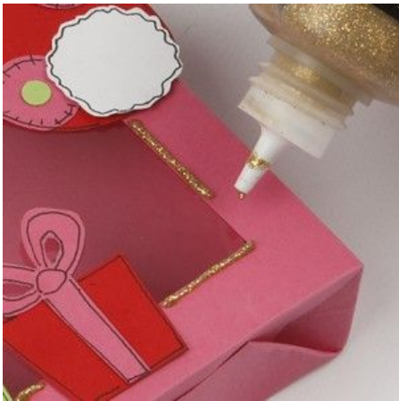
19 Decorate with 3D liner and gold glitter.