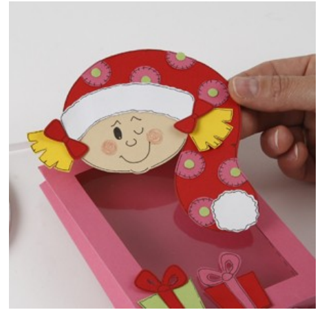
18 Attach the presents and the elf to the bag with double-sided tape.