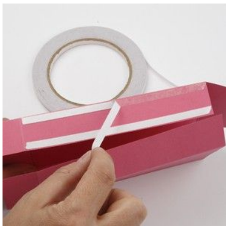
7 Fold the bag and assemble it with double-sided tape.