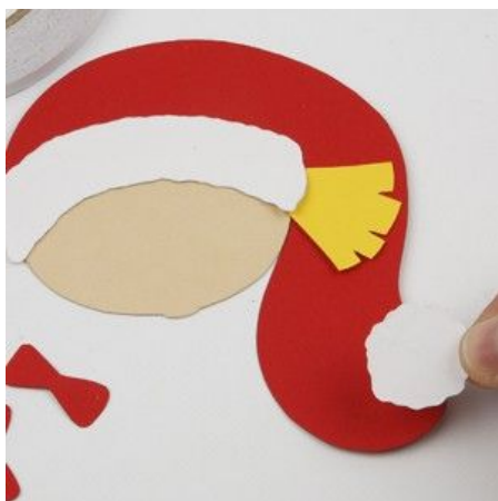
11 Assemble the parts with double-sided tape.