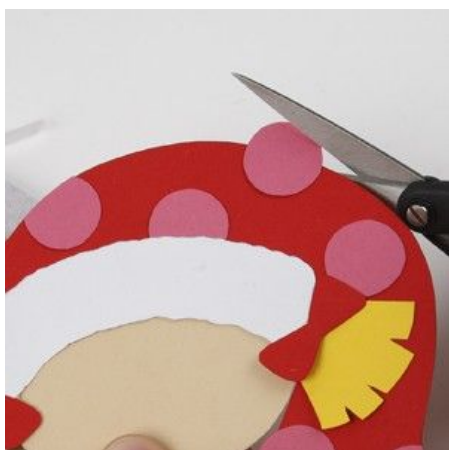
13 Lim prikkerne på huen med dobbeltklæbende tape og klip derefter huens kanter rene.