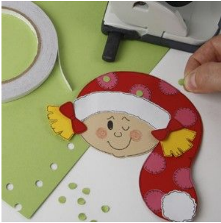
16 Make small dots for the hat using a hole puncher and attach them with double-sided tape.