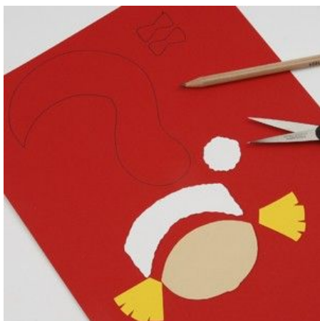
10 Cut out the elf parts in cardboard from the patterns.