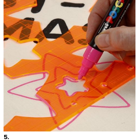
Draw outlines of stars, using a Fiskars template and a Uni Posca Marker.

When making light prints, remove some of the paint by lightly pressing onto a piece of absorbent kitchen roll, before stamping.