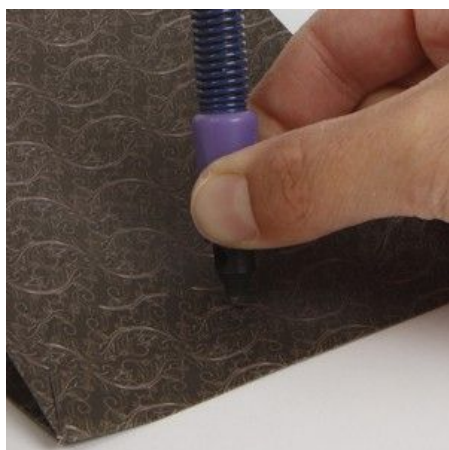
8 Make a hole for the brad with an eyelet tool and attach the brad.