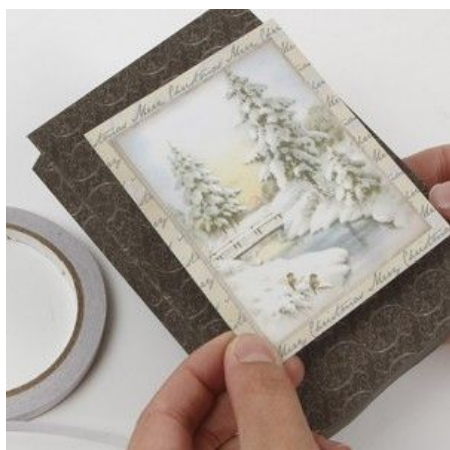
7 Attach this onto the bag using double-sided tape.