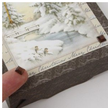
9 Decorate with rhinestones.