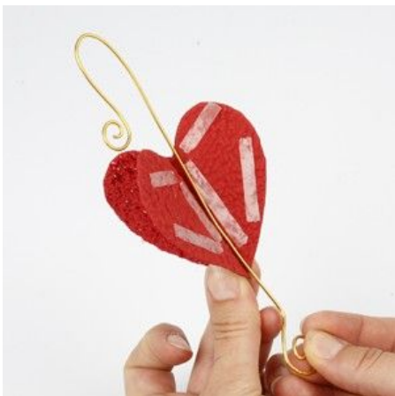
7 Put the bar in the middle.