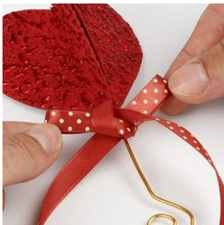
10 Make a bow.