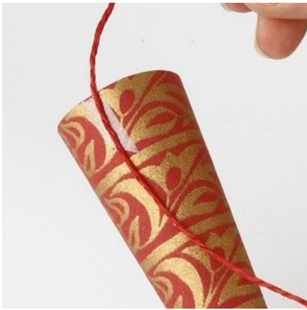
2 Attach a paper cord. Let the end hang downwards.