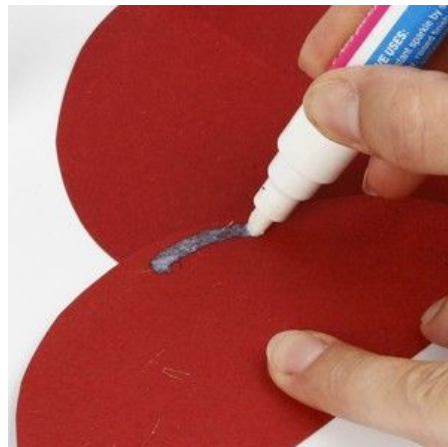
5 Put on glue like in the pictures.