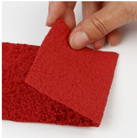
2 Fold a piece of red paper.