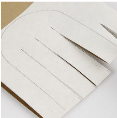
2 Cut them out.