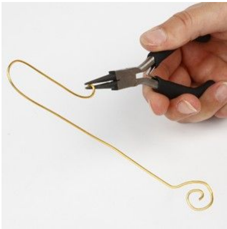
1 Cut approx 25. cm bonsai wire and bend it like in the picture.