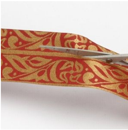
7 Cut out a paper stripe for a handle in the wanted length and width.