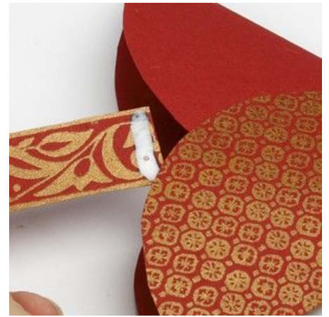
9 Attach the handle to the heart.