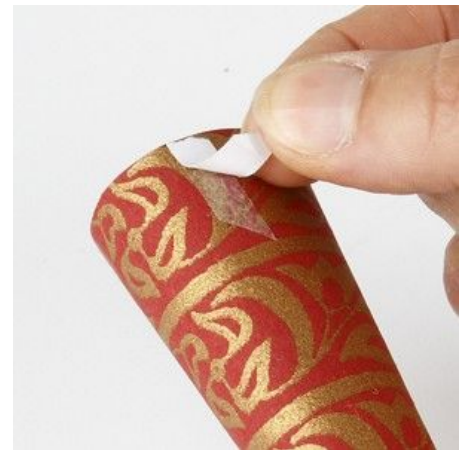
1 Attach 2cm. double-sided tape like in the picture.