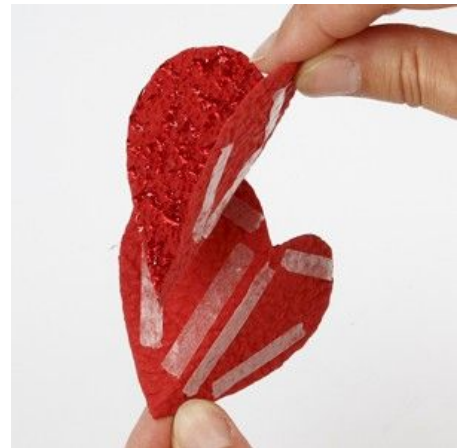
6 Attach two together as shown.