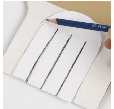
1 Draw two pcs. paper according to the pattern.