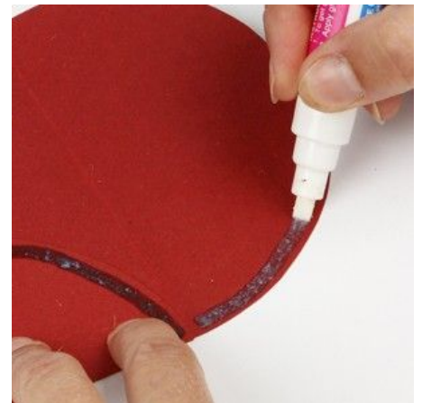
6 Put on glue like in the picture. Repeat on the opposite side.