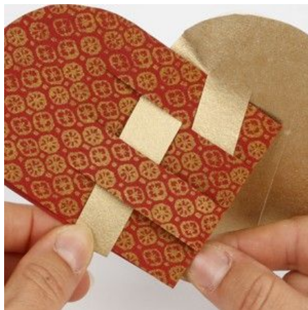
3 Plait and attach handle. Can be decorated with 3D liner in gold glitter.