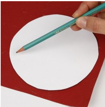
1 Draw a circle.