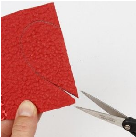
4 Cut out. Repeat until you have 3 hearts.