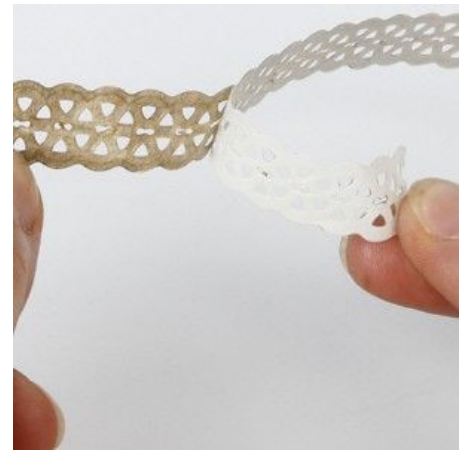
2 Remove the rear paper.