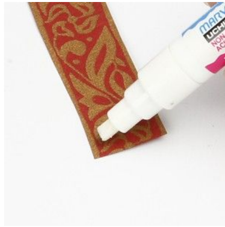
8 Add glue on the front of the handle like in the picture.