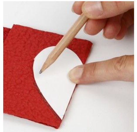
3 Sketch model.