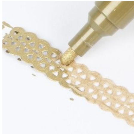
1 Paint paper laces with a gold marker.