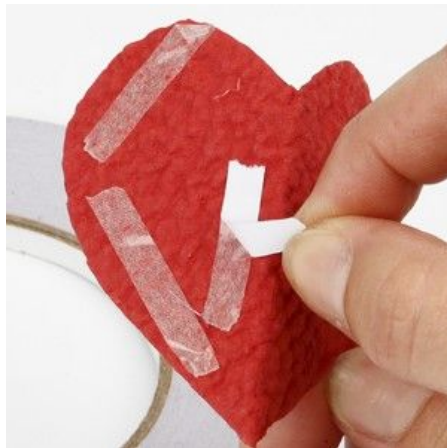
5 Put double sided tape on the inner side of the hearts.