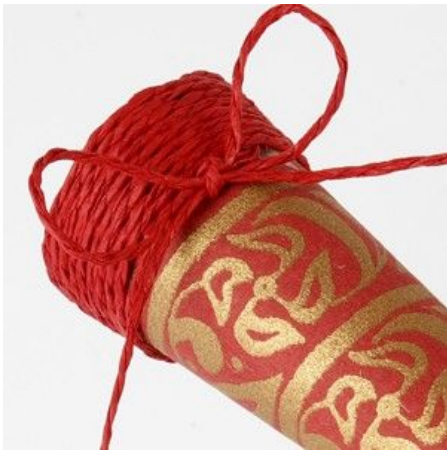
5 ... and end it with a bow.