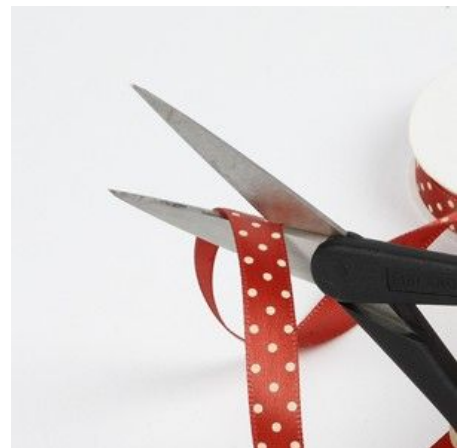
9 Cut a matching ribbon.