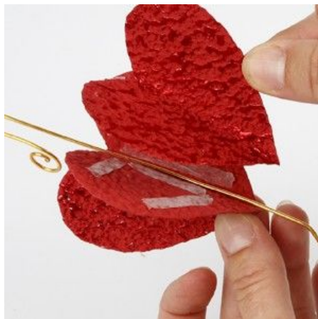
8 Mount the final heart.