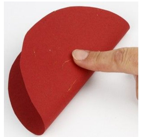
3 Fold at the middle.