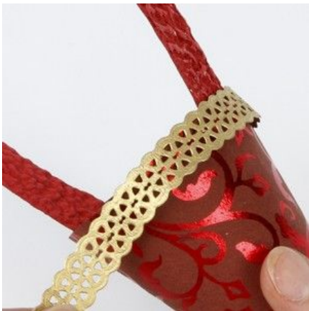
3 Fasten it to the cone.