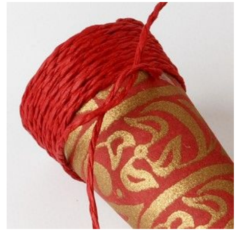
4 Connect the two ends.