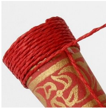
3 Attach double-sided tape around the border and twist the paper cord tight.