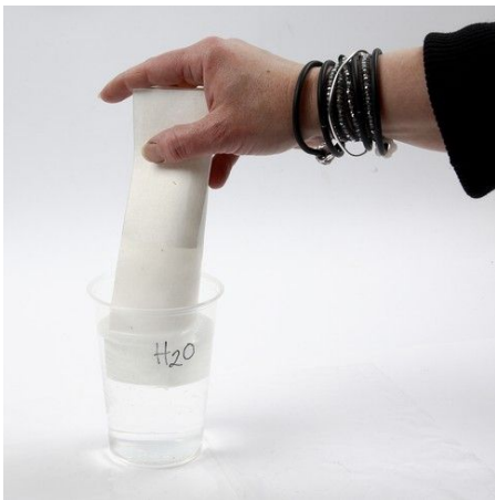
1. Lightly moisten the paper with water.