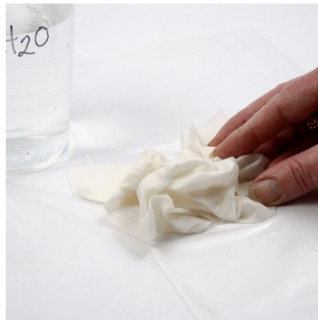
2. Scrunch up the moist paper and place it on a piece of plastic.