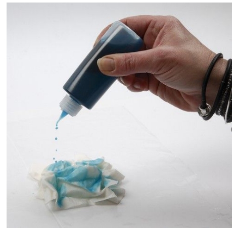
3. Dab water-colour paint, Art Aqua mixed with water onto the moist paper. Let the paper dry. Leave it in its scrunched up shape, letting the watercolour get a varied and exciting movement in the fibres of the paper.