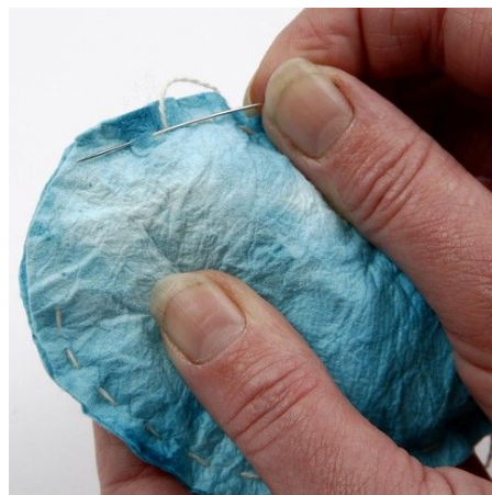
5. Use a piece of mercerised cotton yarn for sewing the parts together with tacking stitches. Leave an opening of 5cm for filling the shape with polyester stuffing.