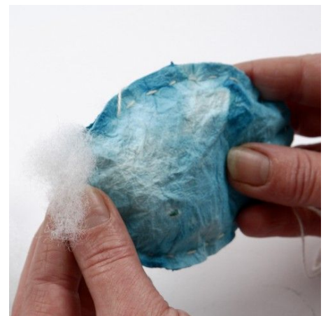
6. Fill the shape with polyester stuffing and close the hole with tacking stitches.