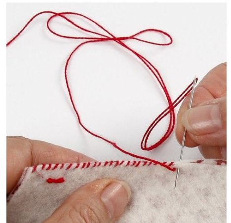
3. Sew the bodies and the pixie hats together by hand.