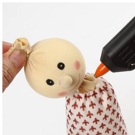
5. Glue the head onto the edge.