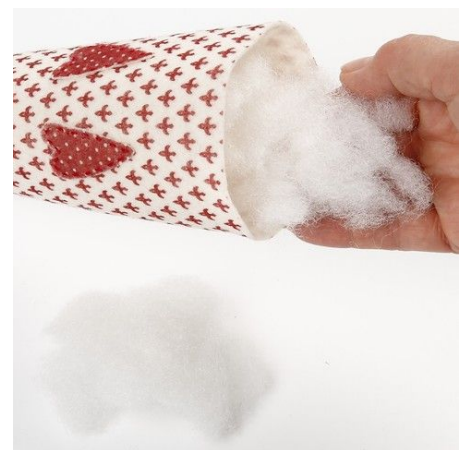
6. Lightly stuff the body with polyester stuffing.