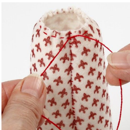
4. Sew tacking stitches at the neck and tie loosely.