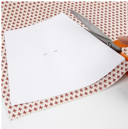
1. Cut out all the felt pieces using the template.