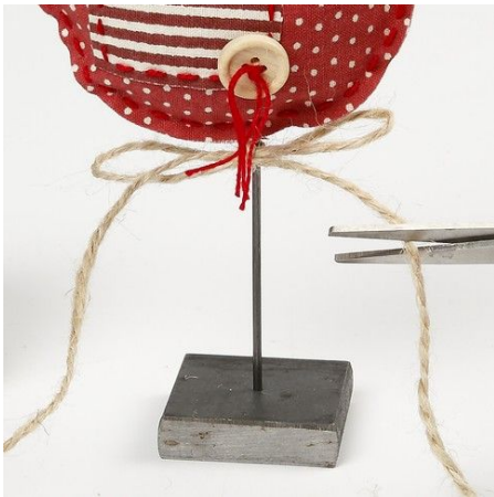
10. Tie a piece of natural hemp around the metal bar where the bird joins, and trim.