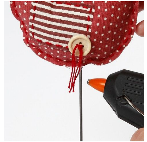
9. Push the fabric bird over the metal bar and glue in place.