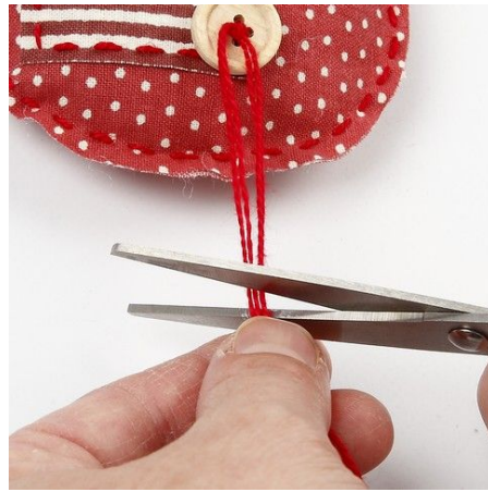
8. Trim the ends.