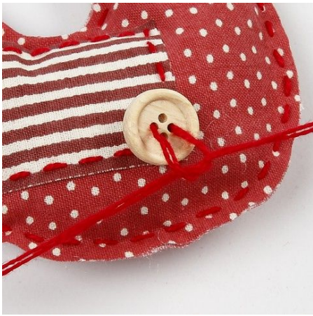
7. Tie a knot on the piece of thread.