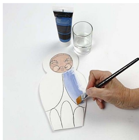
3. Paint with diluted Pigment paint. Skin colour is achieved by mixing brown with white.