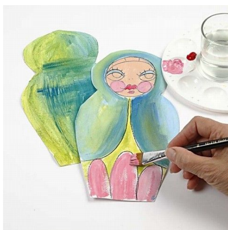
5. Prime red mixed with white results in different shades of pink. Remember to also paint a canvas figure for the back.