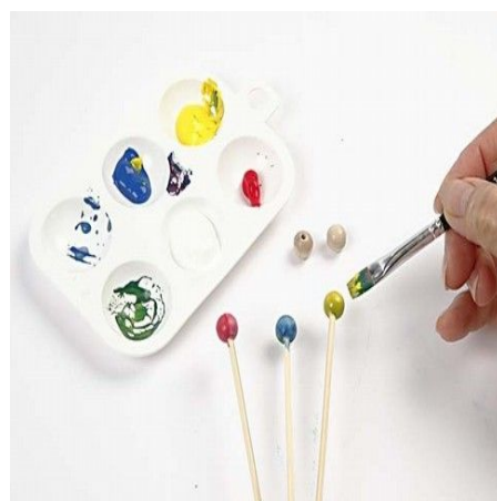
6. Paint wooden beads in matching colours.