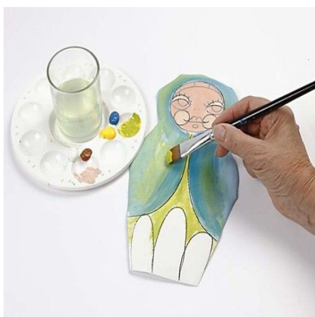
4. When adding a small amount of blue paint in the yellow paint, this results in a beautiful lime colour.