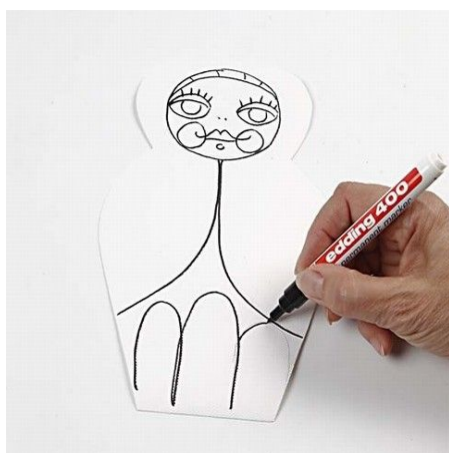
2. Outline the pencil lines with a black marker pen.