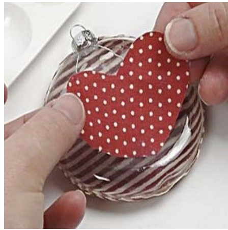
8 Attach this onto the glass bauble.