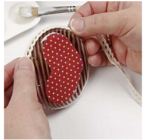
9 Blonden limes på kanten til slut.