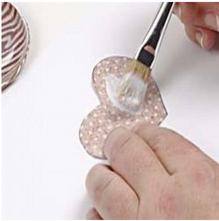
7 Apply some A-color Allround medium glue lacquer on the back of the heart.