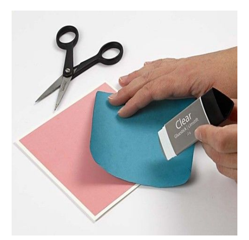
2. Now cut out the patterned paper and glue it onto the card, on top of the background piece of paper mentioned above.