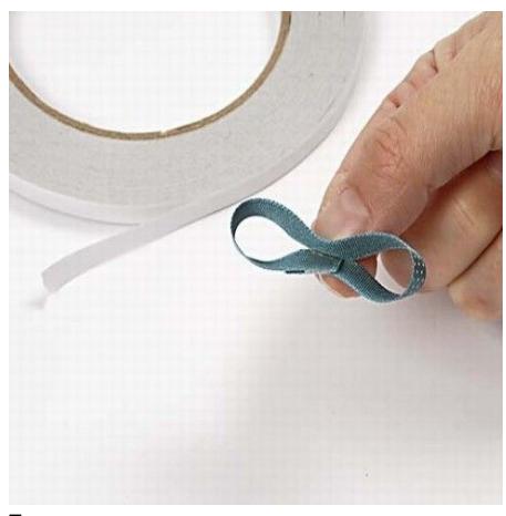
7. To make a small bow, make a ring using a small piece of ribbon and close it in place with double-sided adhesive tape.