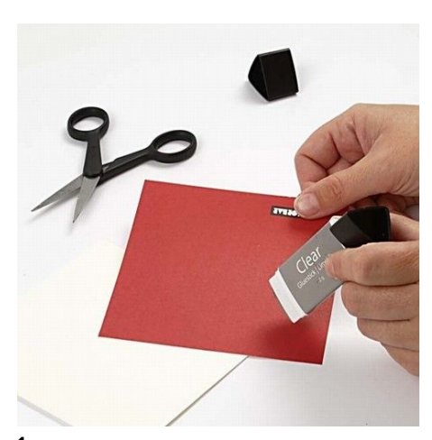
1. Cut out the paper for the background and glue it onto the card.