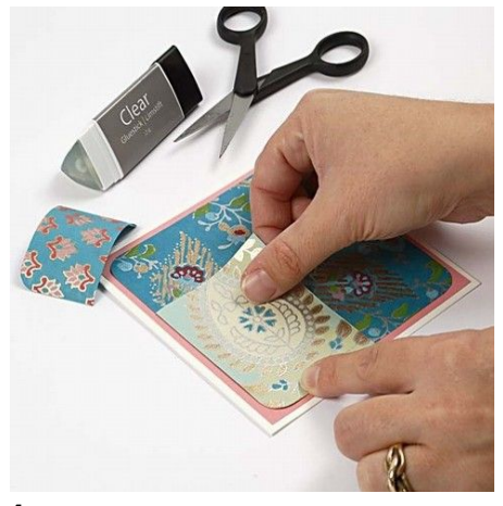
4. Attach several pieces of paper in various sizes onto the card.