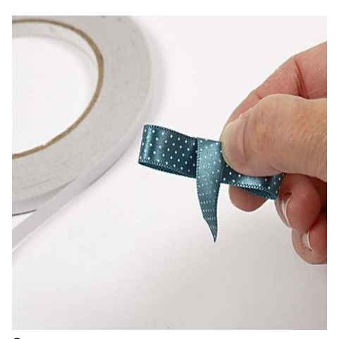
Attach a small piece of ribbon across.