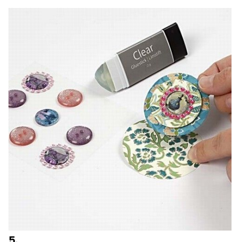
Cut out circles and glue them together. Finally, decorate with 3D shape stickers.