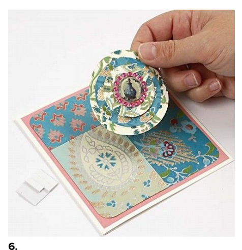
Attach to the card using foam pads.