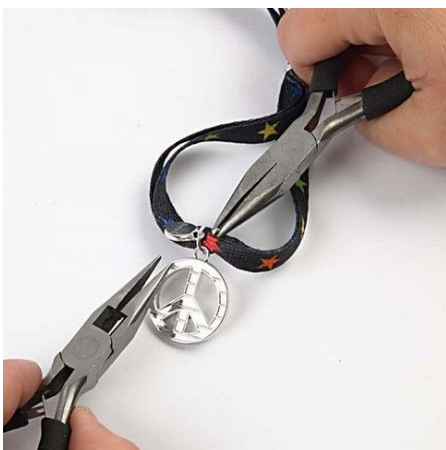
4. Attach a pendant onto the round jump ring onto and attach the round jump ring onto the shoe lace.