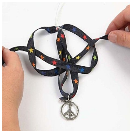
5. Start braiding – start where the silver-plated wire is twisted around the shoe lace.