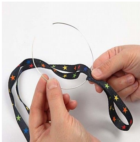
2. Pull a piece of silver-plated wire through the loop of the lace as shown in the photo.