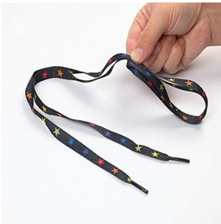
1. Snørebåndet foldes på midten og bukkes ca. 10 cm tilbage.