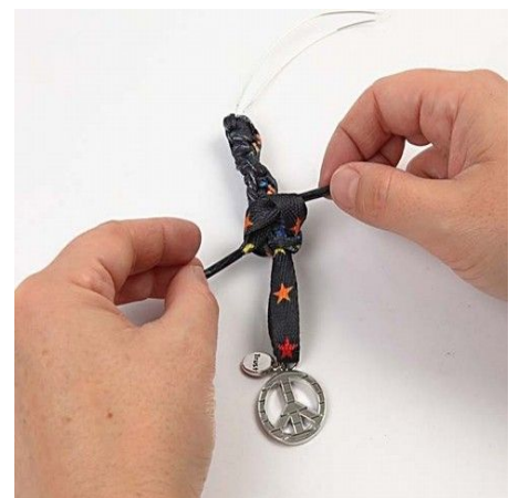
6. Always braid to the same side – i.e. always start with the same lace. This results in a twisted braiding. Finish by tying a knot.