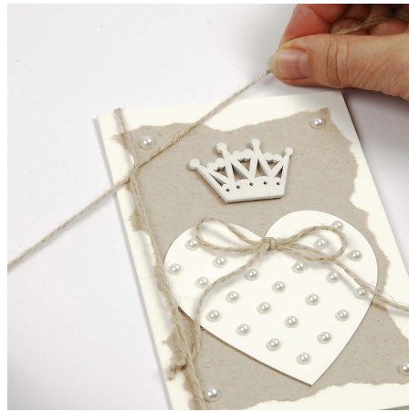
8. Tie a string around the card vertically.