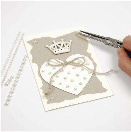
7. Attach a self-adhesive rhinestone half-pearl in each corner.