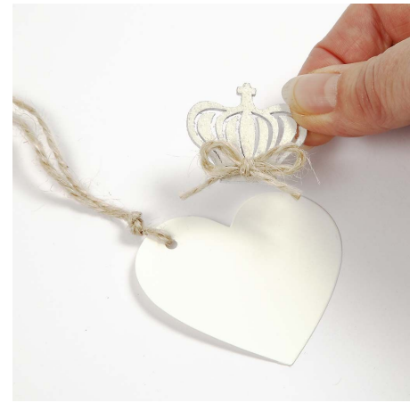
9. Use a small heart as a place card and decorate it with a piece of string, a crown and self-adhesive rhinestone half-pearls.