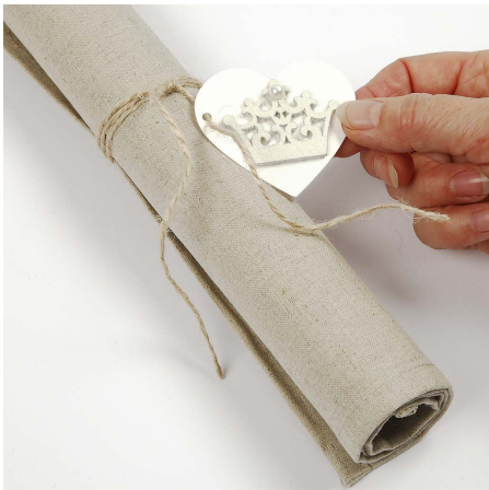
10. For the napkin ring use a punched out cardboard heart, a crown, self-adhesive rhinestone half-pearls and a piece of string.