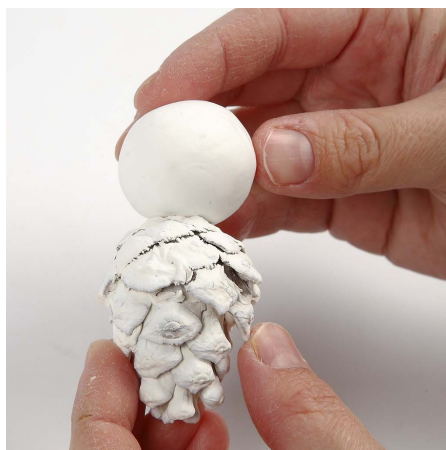
5. Attach a ball of white Silk Clay to the cone for the head.