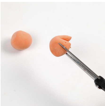
4. Roll two balls from Silk Clay and cut two notches in each ball.