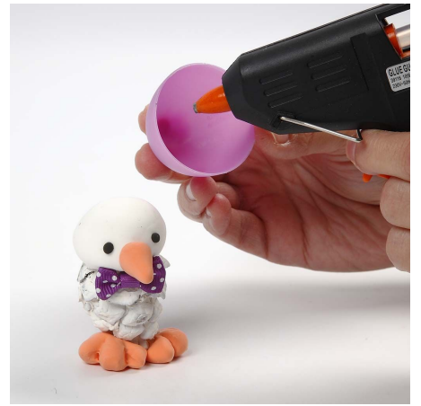
9. Glue on the egg shell with a glue gun.