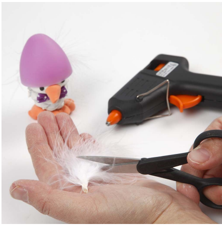
10. Cut off the tip of a turkey feather and glue it onto the back of the chick.