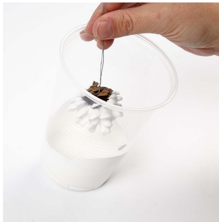
2. Dip the cone in slightly diluted A-Color acrylic paint.