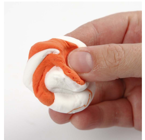
3. Mix orange and white Silk Clay.