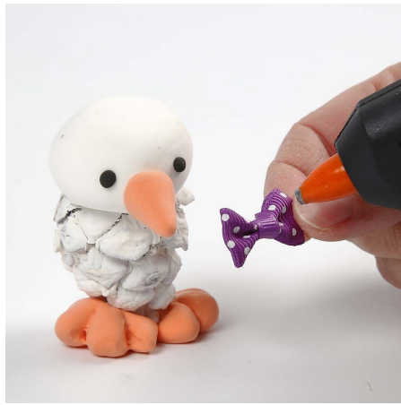
8. Glue on the bow with a glue gun.