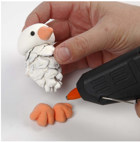
7. Glue on the feet with a glue gun.