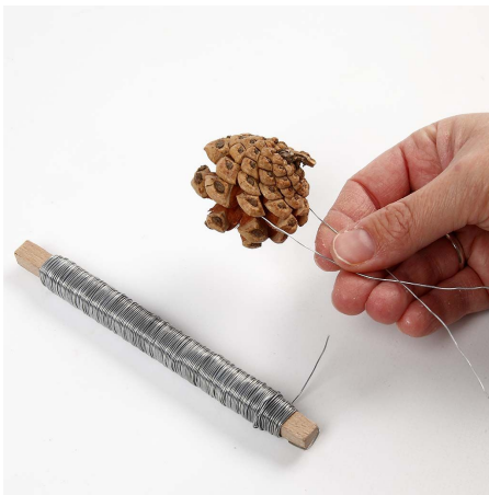
1. Wrap a piece of floral wire around the lower cone ring.