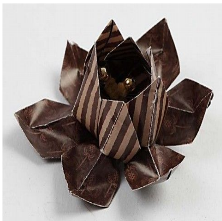
16. And the lotus flower is finished.