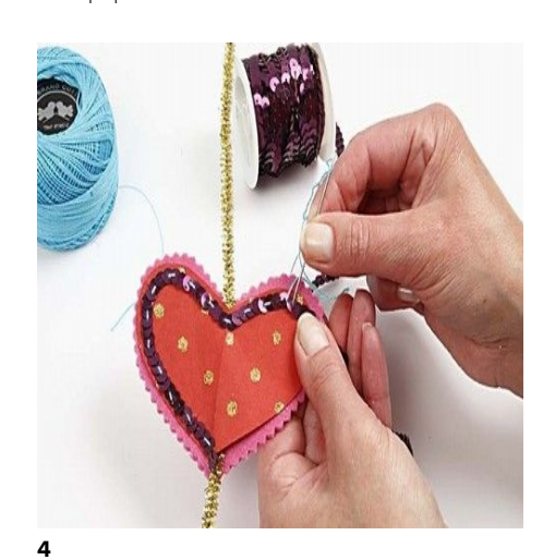
Sew the pieces together and perhaps sew on a sequin ribbon along the stitches using cotton yarn. Use a contrasting colour