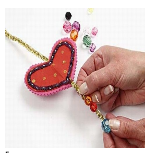
Attach beads onto the pipe cleaner.