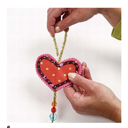
Finish with a loop on top of the pipe cleaner and put the end underneath the paper. You may use a blob of glue.