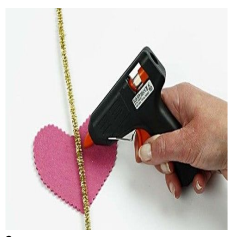
Place the pipe cleaner on top of the felt heart and glue it in place.