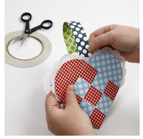
4. Attach the handle with double-sided adhesive tape.

Decorate the heart with doilies. You will need four doilies which are attached onto the heart using double-sided adhesive tape.