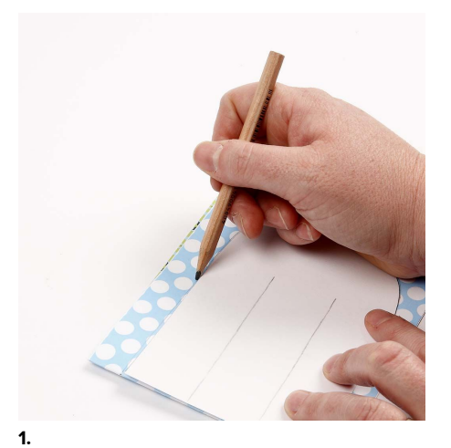
Draw the heart and the handle on London Design Paper using the template and cut out.