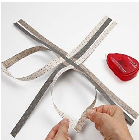
4 Twist the two strips nearest each other in each corner half a turn and glue the ends together. Make another star just like this one.