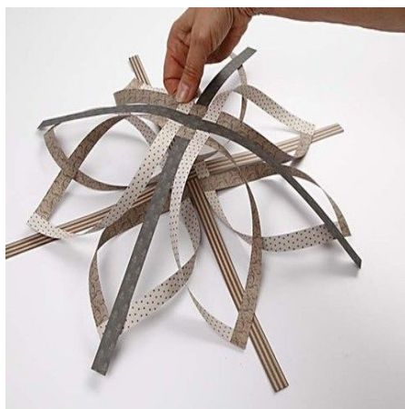
5 Put the two stars together, back to back, rotate them 45 degrees and glue them together.