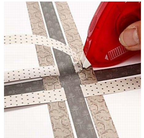
3 Glue the strips together with E-Z adhesive runner where they overlap.