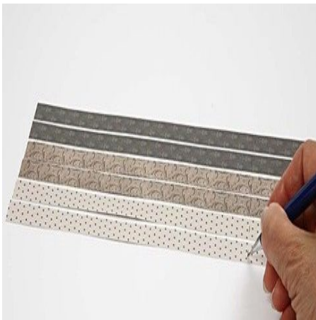
1 Mark the middle of six weaving paper strips.