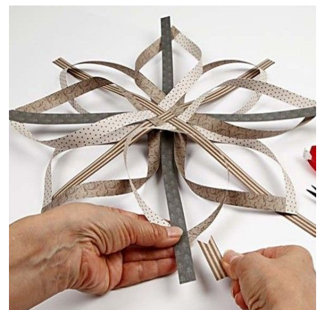
6 Glue the straight strips onto each star tip and trim. Make one and use the cut-off to measure the length of the others.