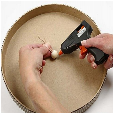
10 Finally thread a bead onto the leather cord and glue it onto the inside of the box.