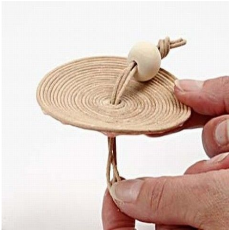
7 Make a hole in the middle of the leather spiral. Pull the folded leather cord through the spiral and the double-sided adhesive sheet.