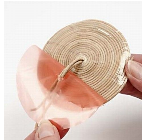
9 Then remove the protective layer of the double-sided adhesive sheet and pull the leather cord through the hole in the box lid.