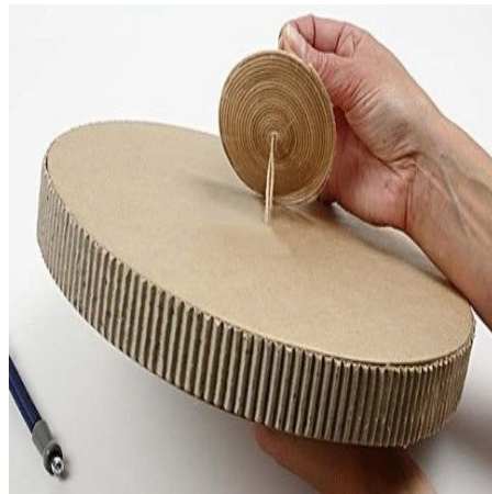
8 Make a hole in the middle of the lid with an eyelet setter.