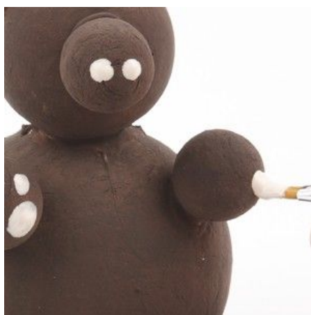
5 Then paint details or dots.