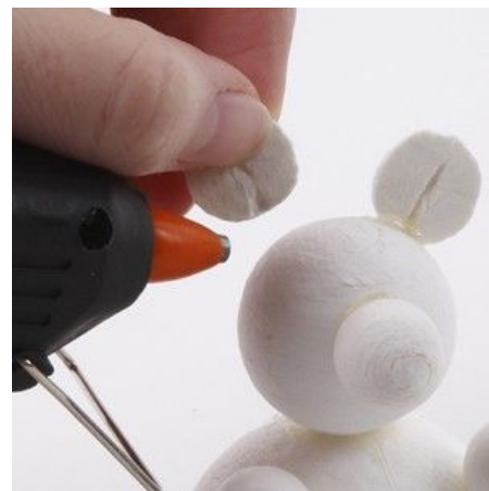
3 Glue these onto the animal.