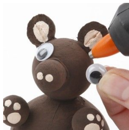
6 Then paint details or dots.