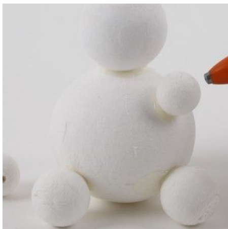
1 Glue cotton balls together to make an animal using a glue gun.