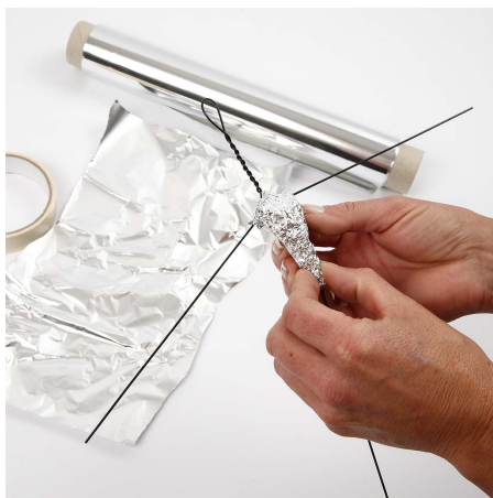
2 Make the body with crumpled up tinfoil.