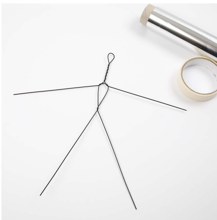
1 Make a skeleton from two stub wires.