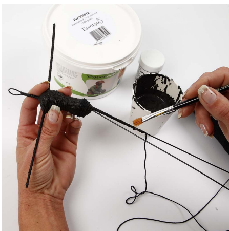
4 Mix Paverpol and Paver Color. Moisten the twine in Paverpol and wrap it around the skeleton. Finally brush on Paverpol.