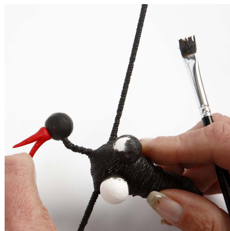
6 Shape a beak in Cernit and attach it using Paverpol. Glue one leg into the hole in the metal base with a glue gun.