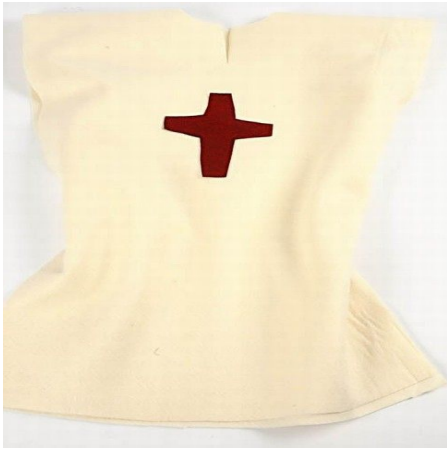
7 The finished knight's cape made for a crusader.