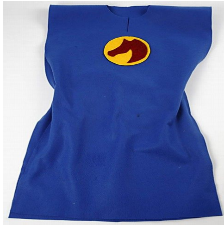
Variant of the knight's cape This knight's cape is made of blue felt with a symbol consisting of a yellow circle and a red horse.