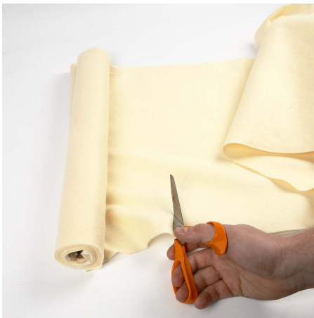
1 Cut the felt to the desired length (measure from the shoulder down to the knee).