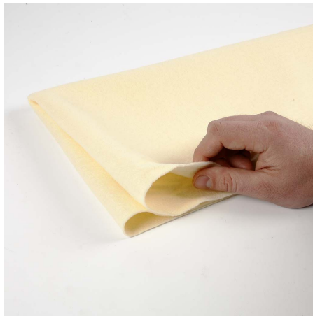
2 Fold the felt two times over the middle to establish where the neck opening should be.