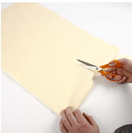
4 Cut a slit in the neck opening approx. 6-12cm.