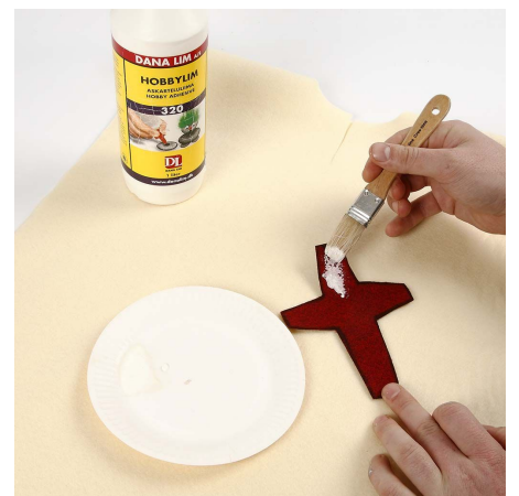
6 Brush the symbol with hobby glue and glue it onto the middle of the knight's cape.