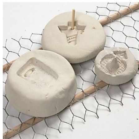
6 IMPORTANT!! □ When you cast with pewter in clay moulds the clay HAS to be completely dry before pouring in the pewter! □ If you pour the melted pewter into damp clay moulds, the pewter will spray because of the water content in the clay. □ Put the approx. 2cm thick mould onto a grid and let it dry at least 3 to 4 days at room temperature.