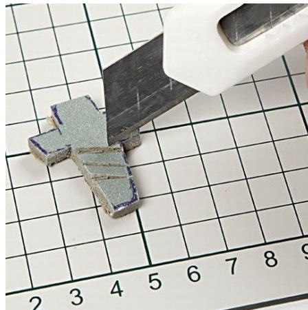
2 Cut out the motif.