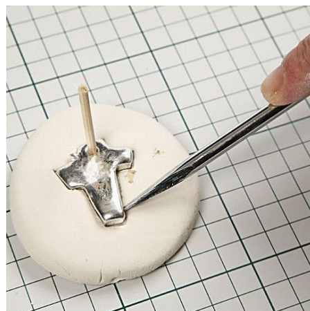
9 Take the motif out of the mould.