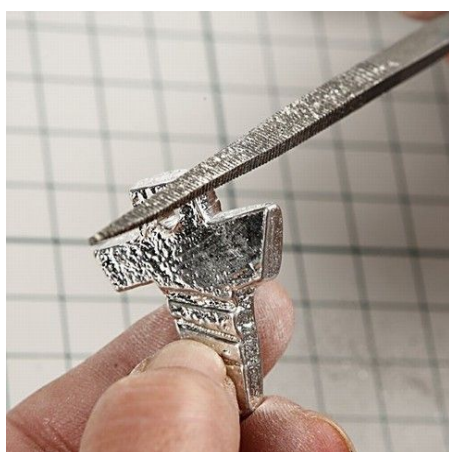
11 File away any rough edges.