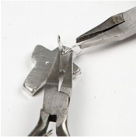
13 Attach round jump rings.