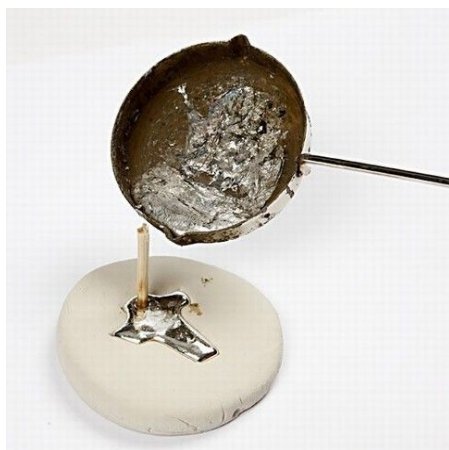
8 Pour the melted pewter into the dry mould.