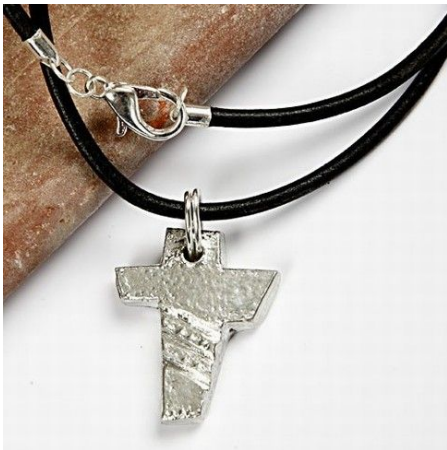
16 Pull on the pendant.