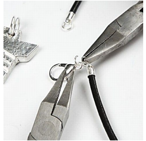
15 Fit round jump rings and a clasp.