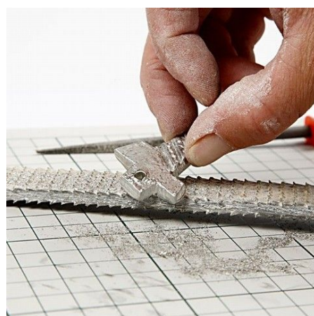
12 File away any rough edges.