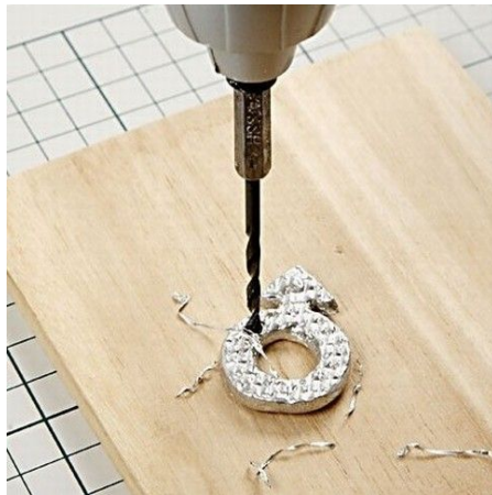
17 Holes are easily drilled in the pewter.