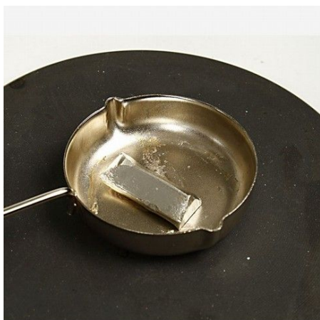
7 Melt the pewter at a high temperature on the hot plate.