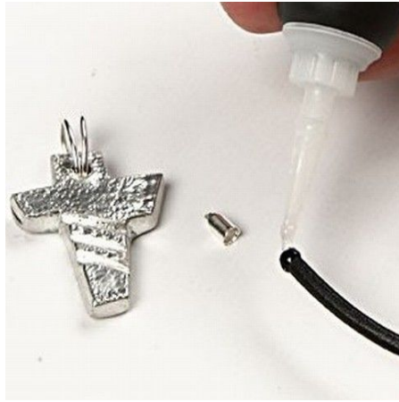
14 Glue end caps onto the leather cord.