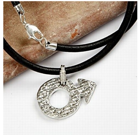
18 Tip: Press the motif with the back of the linoleum down and get a checkered pattern. Twist metal wire around the round jump rings.