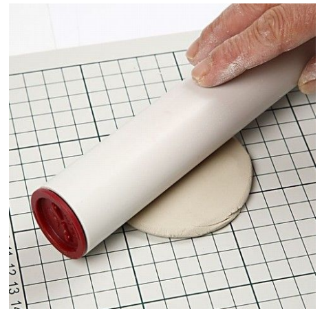
3 Roll a piece of self-hardening clay into an appropriate size for your subject, no thicker than about 2 cm.