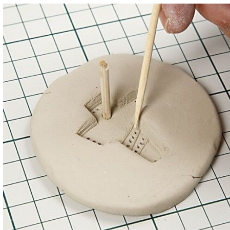
5 Push a flower stick into the clay where the hole to the o-rings/the cord should be. A pattern can be scratched or pricked into the clay. Holes can also easily be drilled in the pewter after casting.