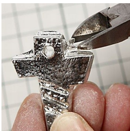
10 Cut off any pewter sprue with a diagonal cutter.