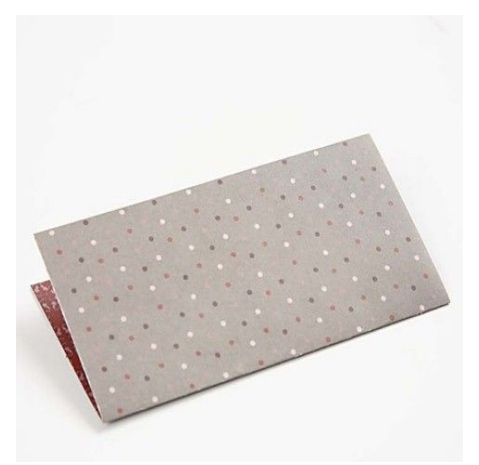
2 Fold in half.