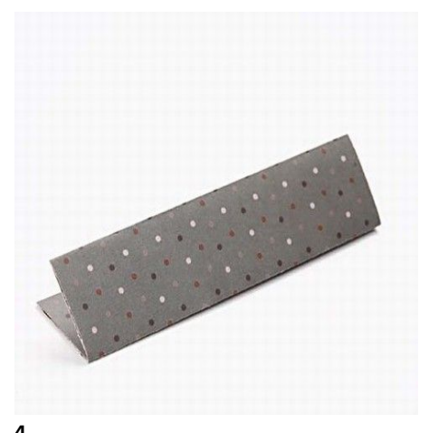
Fold in half and turn the fold down towards yourself.