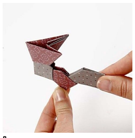
Assemble the decoration by inserting the tips as shown in the photo.