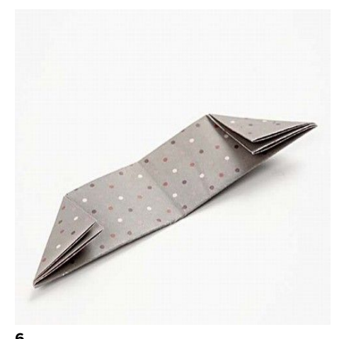
Unfold and fold both corners down towards the bottom fold.