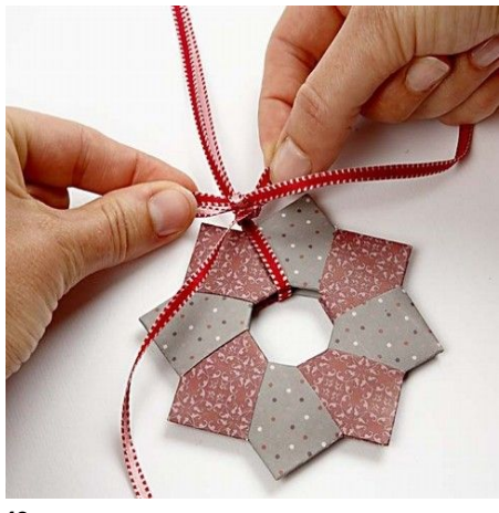
10 Decorate with a ribbon for hanging and a bow. You may attach small rhinestones.