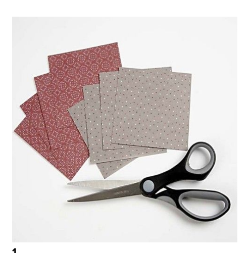
Cut eight pieces of paper measuring 8x8cm.