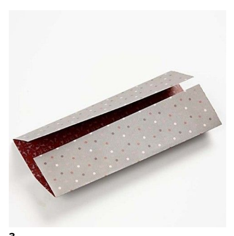
Unfold and fold each side towards the fold in the middle.