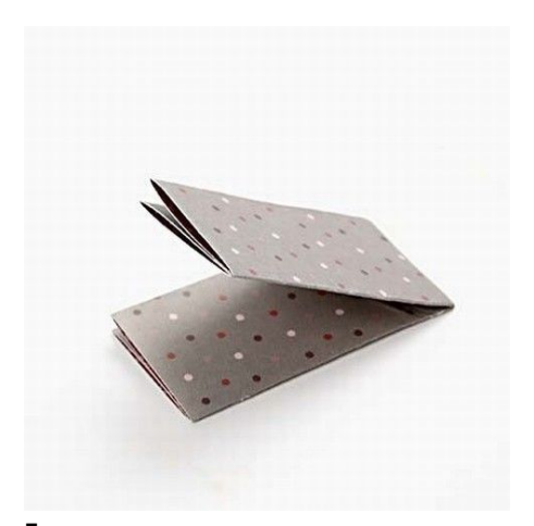
5 Fold in half.