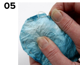
05 Use a piece of mercerised cotton yarn for sewing the parts together with tacking stitches. Leave an opening of 5cm for filling the shape with polyester stuffing.