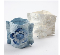
Another variant A candle holder cover: Take a piece of paper, cut and sew the two sides together to fit the height and the circumference of a candle holder. You may sew beads and flowers onto the paper in case you want additional decoration.