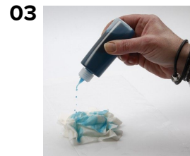
03 Dab water-colour paint, Art Aqua mixed with water onto the moist paper. Let the paper dry. Leave it in its scrunched up shape, letting the watercolour get a varied and exciting movement in the fibres of the paper.