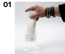
01 Lightly moisten the paper with water.

Deze hangende, papieren paasdecoraties zijn gemaakt van handgeschept papier van moerbei en geverfd met behulp van de klassieke waterverf techniek.