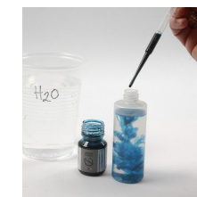
TIP! The ten different colours of Art Aqua can be diluted and thus made \square brighter. To achieve a very light pastel: 1.5 ml, equivalent to 20 drops, is filled into a refill bottle containing 80 ml of water. NB! The turquoise colour, which is the strongest in the kit is diluted with only 8 drops.