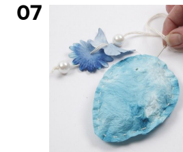
07 Make a piece of mercerised cotton yarn four double for hanging. Thread a bead, a flower and finally the finished paper shape onto the four double mercerised cotton yarn. You may finish with another bead.