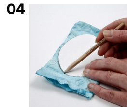
04 Smooth the dry paper by hand. Draw a pattern using the template for this idea which is a separate pdf file. Cut it out.