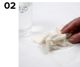
02 Scrunch up the moist paper and place it on a piece of plastic.