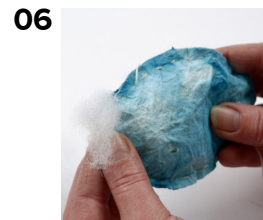
06 Fill the shape with polyester stuffing and close the hole with tacking stitches.