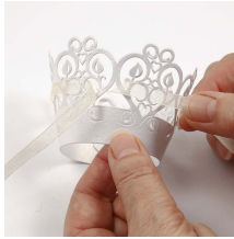
Table Decoration / Decoration for candle holders: Assemble the laser cut border and decorate with organza ribbon and a small satin heart. Place a small candle holder inside.