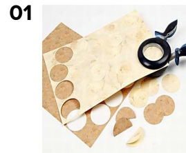
01 Cut out eight circles and fold them in half.

Decoratieve ballen van papier om op te hangen. Gemaakt van 8 circles en aan elkaar gemaakt met goud draad en Glue Dots. Gedecoreerd met parelmoer plastic kralen.