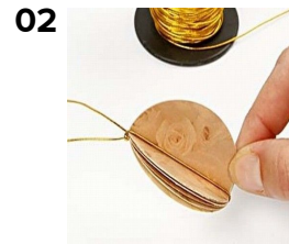
02 Put the circles on top of each other and assemble with a piece of gold thread.