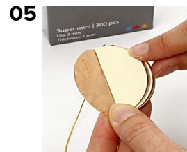
05 Now assemble the sides towards the left by attaching the Glue Dots approx. ¼ from the top.