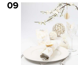
09 Decorate the thread for hanging with mother-of-pearl plastic beads.