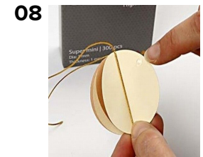
08 Attach a Glue Dot ¼ from the top on the last side.