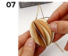
07 This is how it should look like: