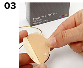
03 Assemble the sides in pairs with Glue Dots. Start by attaching the Glue Dots approx. ¼ from the bottom.