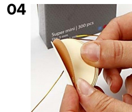
04 Press together.