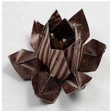
And the lotus flower is finished.