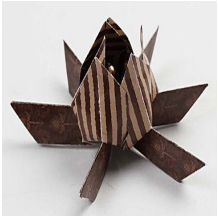
So far so good.