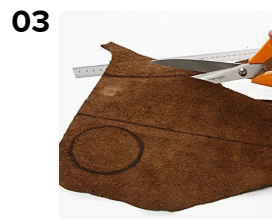
03 Cut out the parts.