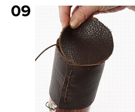
09 Insert the base.