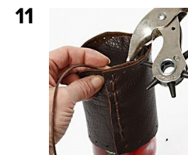
11 When making holes in the base, use the holes made in one end of the sewn cylinder. Make sure the bottom does not slip.