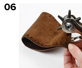
06 Fold the leather and punch through both layers – this makes it easier to achieve the same hole spacing on both sides.