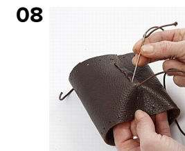
08 Cut a piece of cord measuring approx. 2.5 m. Sew the sides together, starting in the second hole.