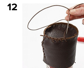
12 Sew the bottom on using buttonholing stitches.