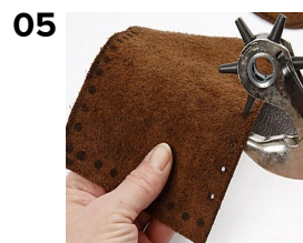
05 Punch the holes with revolving punch pliers.