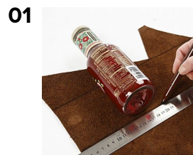
01 Select a bottle you want to use. Measure half the height of the bottle - and add 2cm to the circumference.

Een tas voor een waterfles gemaakt van leer. De bovenrand en het hengsel zijn gehaakt met katoenkoord en gedecoreerd met kralen.[]