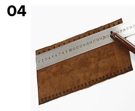
04 Mark the holes: the hole spacing is 1.5cm along the sides, at the ends the hole spacing is 1cm.