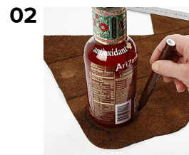
02 Draw around the bottom of the bottle.