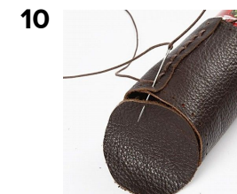
10 Insert the needle through the bottom and pull the string tightly to make it easier to manage the leather when making the holes. Fasten the last stitch temporarily.