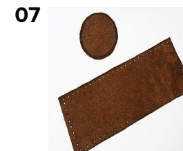
07 Ready for sewing.