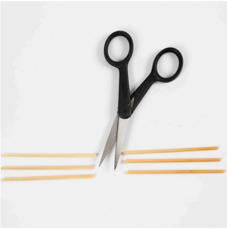
8 Cut 2 x 3 pieces of straw for the horns.