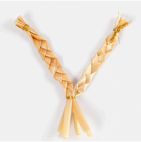
9 Plait each horn individually and secure with gold thread at one end. Tie the horns together at the other end.