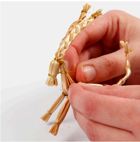
11 Tie gold thread around the muzzle and force the head down by tying the gold thread around the neck.