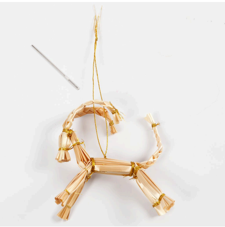
12 Tie a piece of gold thread onto a straw (on the back) for hanging.