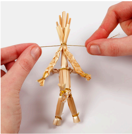
10 Tie the horns, together with the head, on the existing joint. Trim the straw.