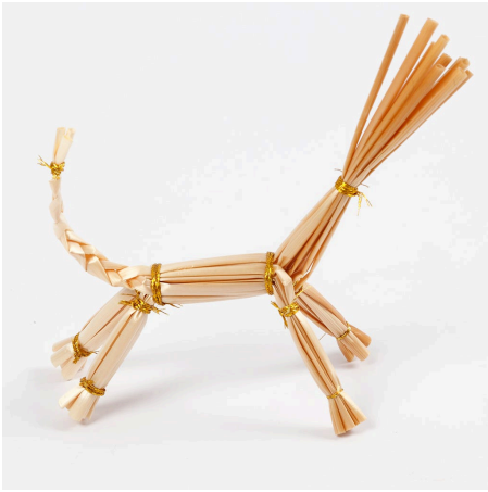
7 Make the straw goat's neck by tying the remaining pieces of straw together as shown in the photo.