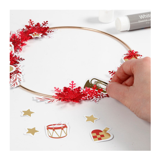
Attach the card cut-outs between the snowflakes using a glue stick or glue them directly onto the metal ring.