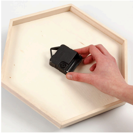
6 Fit the clock mechanism from the front of the tray as illustrated in the picture. You may make a hole in the faux leather paper with a craft knife in the same place where the hole in the tray is in order to achieve a neat result.