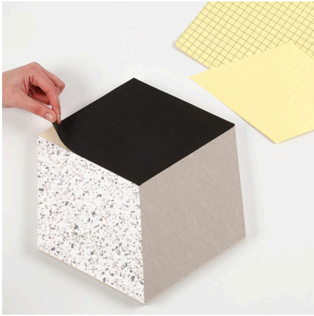
5 Attach the pieces of faux leather paper onto the back of the tray using double-sided foil tape.