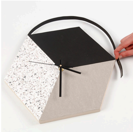
9 Attach the ends of the faux leather paper star strip onto each side of the wall clock and press firmly.