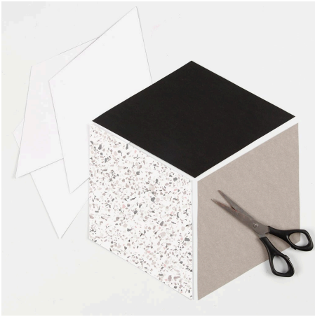
4 Cut out the template and use it for cutting out three pieces of faux leather paper.