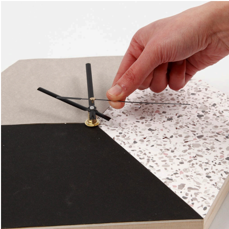
7 Assemble the clock mechanism as illustrated on the packaging.