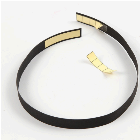
8 Cut a 50 cm faux leather paper star strip for hanging the wall clock. Cut two pieces of double-sided foil tape the same width as the faux leather paper star strip and attach a piece at each end.