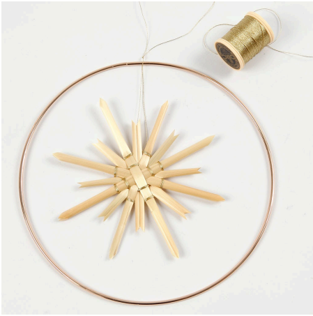
4 Fix the two straw stars together with gold thread like in step 2. If the straws are sticking out at an angle, you may place a heavy book on top until it is dry. Hang the straw star in the middle of a metal hoop using gold thread.