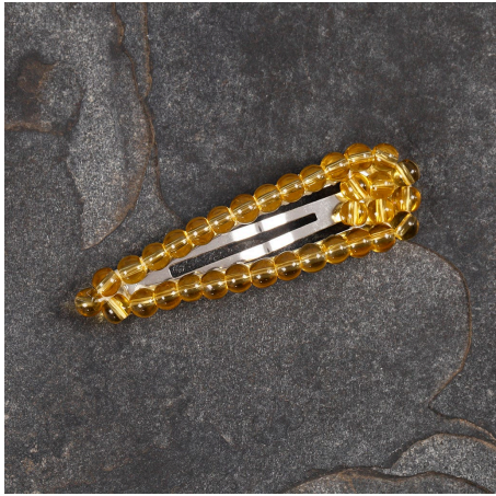
9 The finished hair clip.