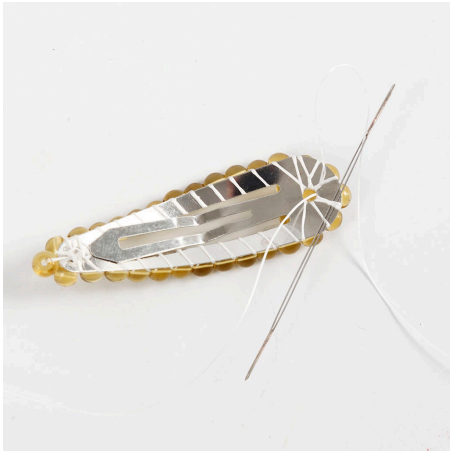
8 Secure the end of wire on the back of the hair clip.