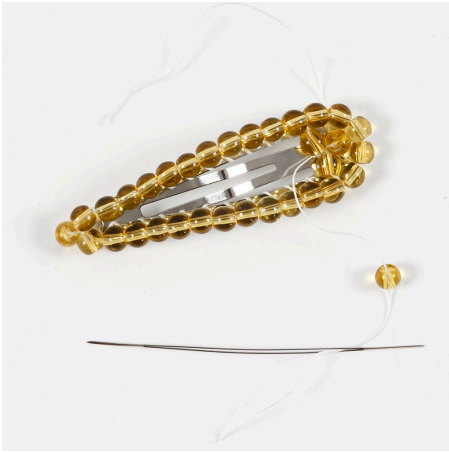
7 Sew on the last (fourth) bead.