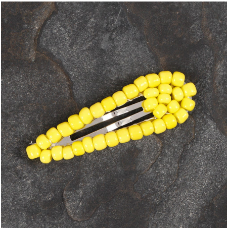
10 You may use the same procedure when making a hair clip with rocaille seed beads. Here we have sewn on seven beads like a flower at the end of the hair clip.