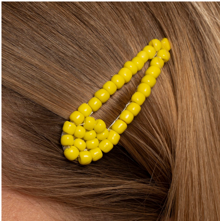
Another example -