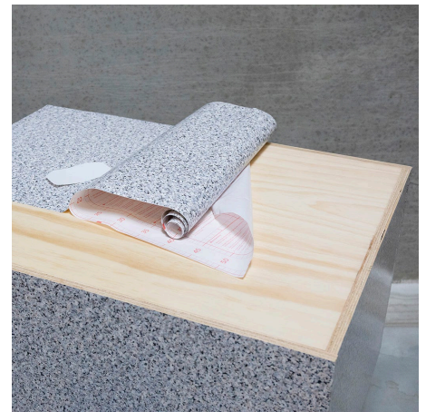
9 The self-adhesive film fits across the width of the 45 cm wide podium. Start with the sides and make sure to start away from the edge on one side, so that the foil can overlap. Finish with the top board; attach the foil 2 cm over the sides so that you can cut a notch for the corners to be stuck down over the sides.