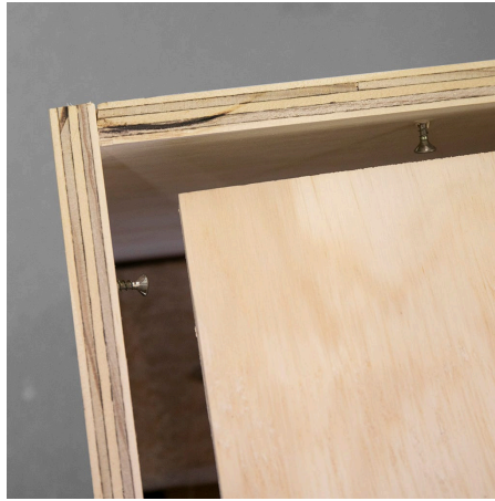
5 Place the top board onto the screws. The measurements of the top board are 60 x 80 cm.