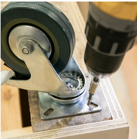
7 Screw on the casters.