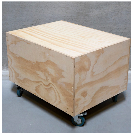
8 The podium is now finished.