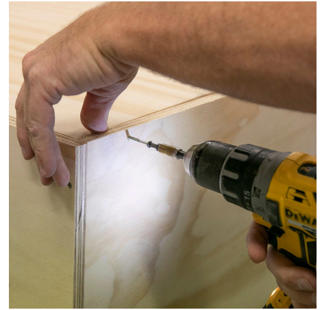
6 Screw on the top board.