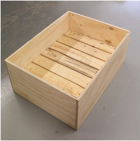
4 The podium without the top.