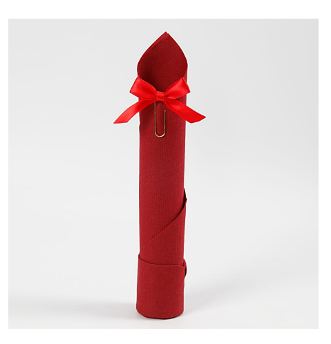
Attach a paper clip with a bow for the finishing touch.

Fold the end to secure the napkin and to hide the end.