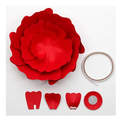
1 Assemble the paper flowers as shown on the back of the packaging.