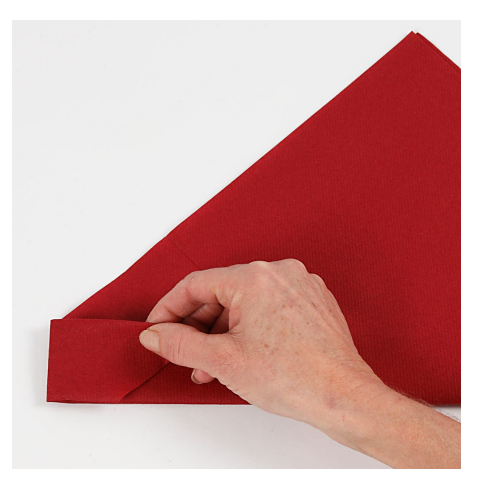
9 Turn over the napkin and bend one end towards you.

Fold the long end so that the fold is approx. 4.5 cm wide.