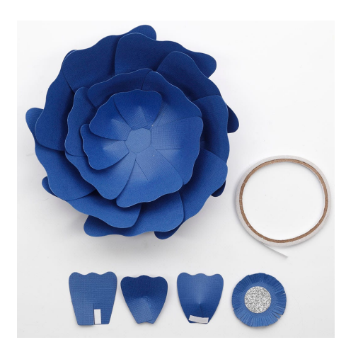
1 Assemble the paper flowers as shown on the back of the packaging.