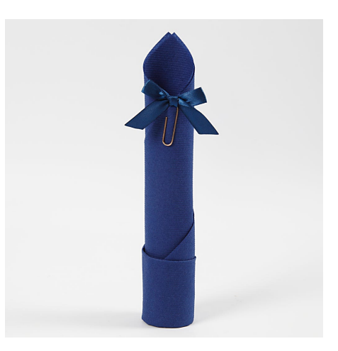
Attach a paper clip with a bow for the finishing touch.

Fold the end to secure the napkin and to hide the end.