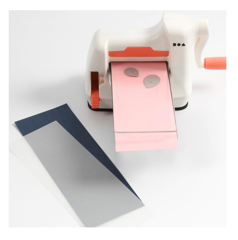
3 For punching out a card balloon; Use cutting plate C underneath + card + die + base plate B on top.