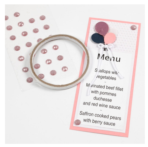
Print out the menu text and attach it onto the menu card with double-sided adhesive tape. Decorate further with rhinestones.