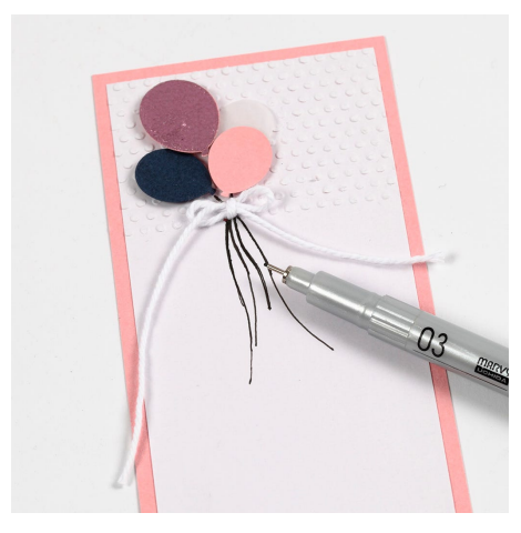
Attach the balloons onto the front of the menu card with 3D foam pads. Draw balloon strings with a thin marker. Tie a bow from cotton cord and attach it onto the menu card with double-sided adhesive tape.