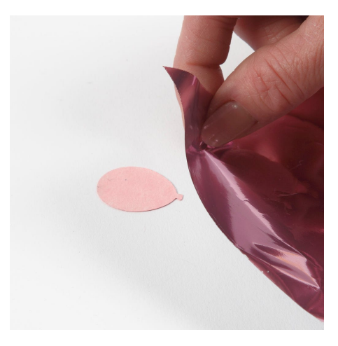
Place the deco foil on top and rub hard to attach it onto the sticky foil tape.