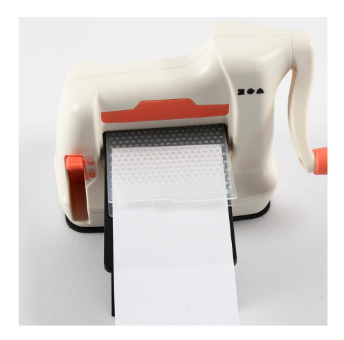
1 Cut a 7 x 17 cm piece of white paper. Place 1/4 of it onto the embossing folder between base plate B and embossing plate E. Run it through the die-cutting and embossing machine for an embossed design on 1/4 of the white paper.