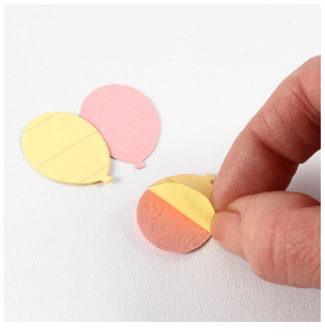
Remove the protective paper layer from the other side of the sticky double-sided foil tape.