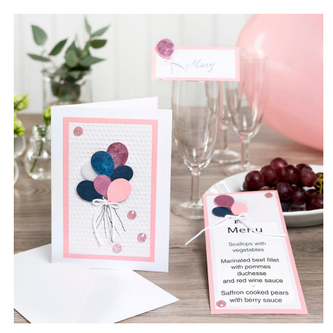
See our matching ideas: Invitation 15340 Place card 15394