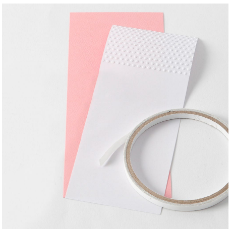
2 Cut a 7.5 \times 18 cm piece of coloured card and attach the piece of white paper on top with double-sided adhesive tape.