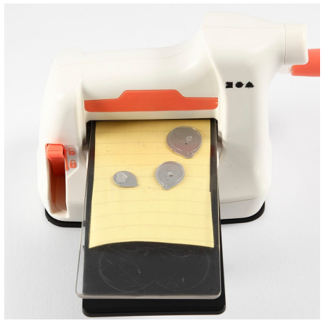
4 Attach double-sided foil tape onto a piece of card and onto a piece of vellum paper. Punch out balloons in different sizes and materials using cutting plate C underneath + card and double-sided foil tape + dies + base plate B on top.