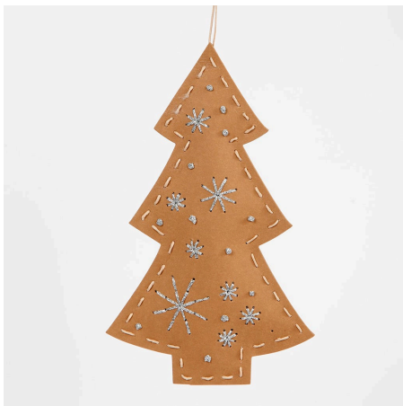
Another variant -