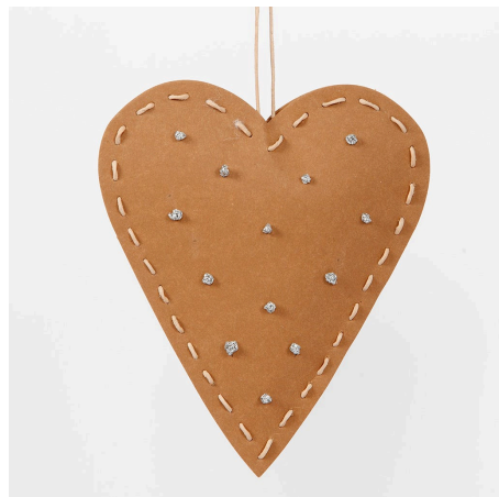
Another variant -