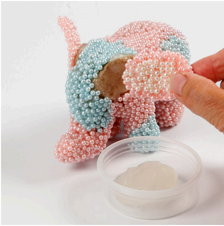
4 Attach the loose ears with the modelling gel (glue). Fill in the gaps with beads.