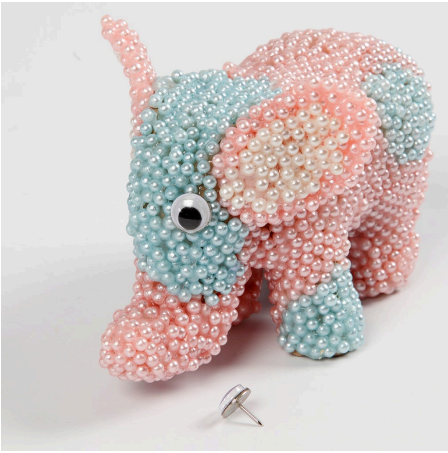
5 Push in the googly eyes.