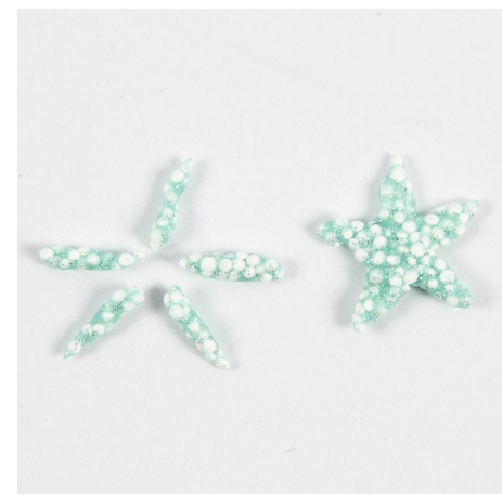
Step 13. - Step 14. - Step 15. -