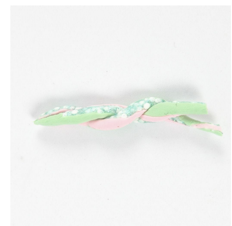
Step 7. - Step 8. -