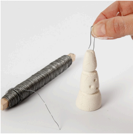
4 Model a U from florist wire and insert it into the top of the cone as a loop for hanging. Leave the finished tree to dry for approx. 24 hours.