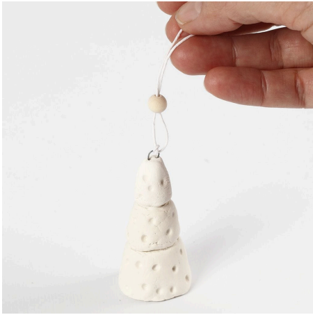
5 Assemble the hanging decoration. Cut a piece of natural hemp and tie it to the loop and decorate with a wooden bead.