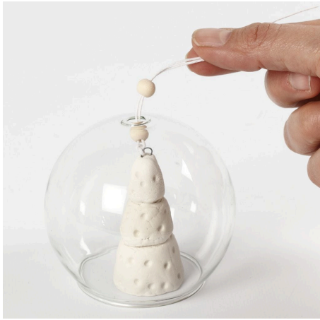
6 Thread the baseless hanging glass bauble onto the piece of natural hemp with the Christmas tree and finish with a wooden bead and a metal star. Tie at the top with a double knot.