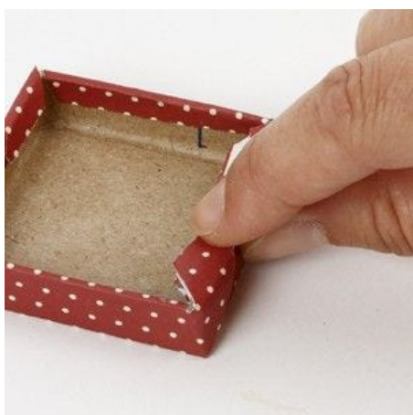
10 Fold it around the edge.