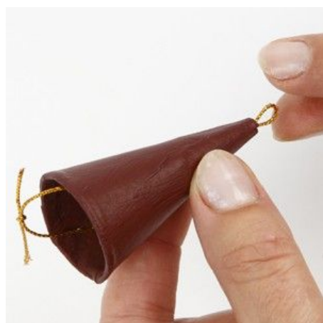
12 Pull a golden string thru the tip of the cone. Tie a knot.