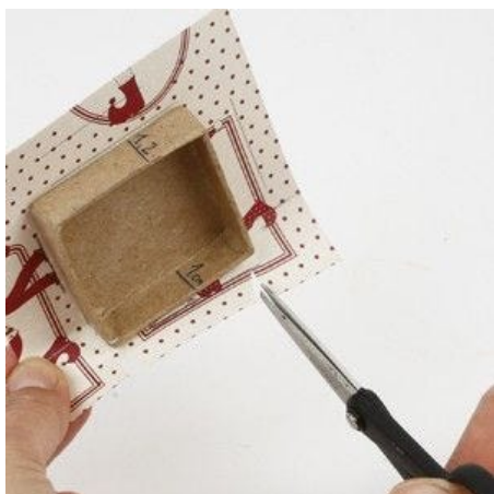
4 Cut a little wedge, and press the paper against the edge.