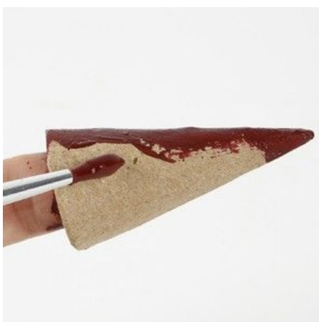
11 Paint the cone Bordeaux.