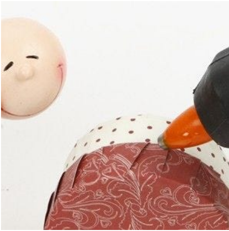
13 Use a glue gun to assemble the head to the box.