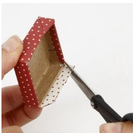
7 Cut the edges of the corners.