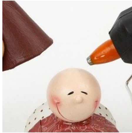
14 Attach the hat using a glue gun. Finish with a knitted tube for the scarf.