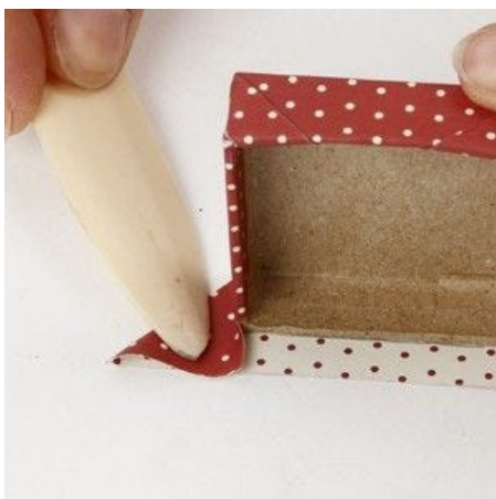
5 Press the corners of the paper with a bone folder.