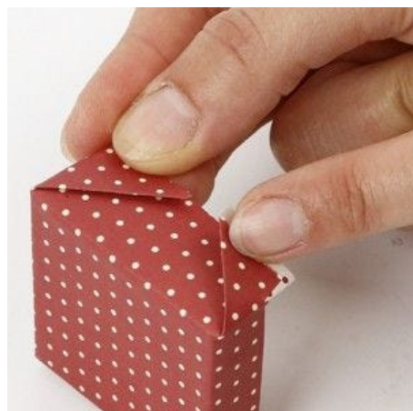
6 Fold against the middle.