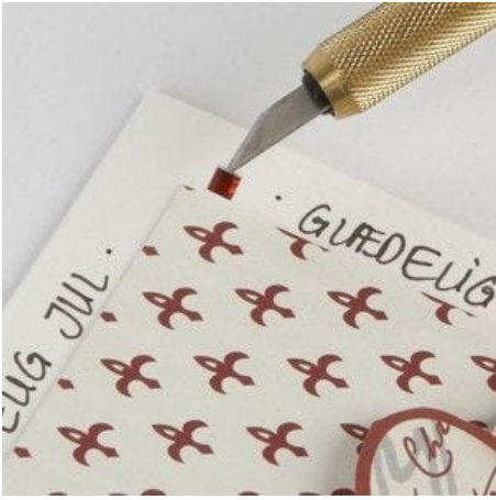
7 Decorate with rhinestone and text.